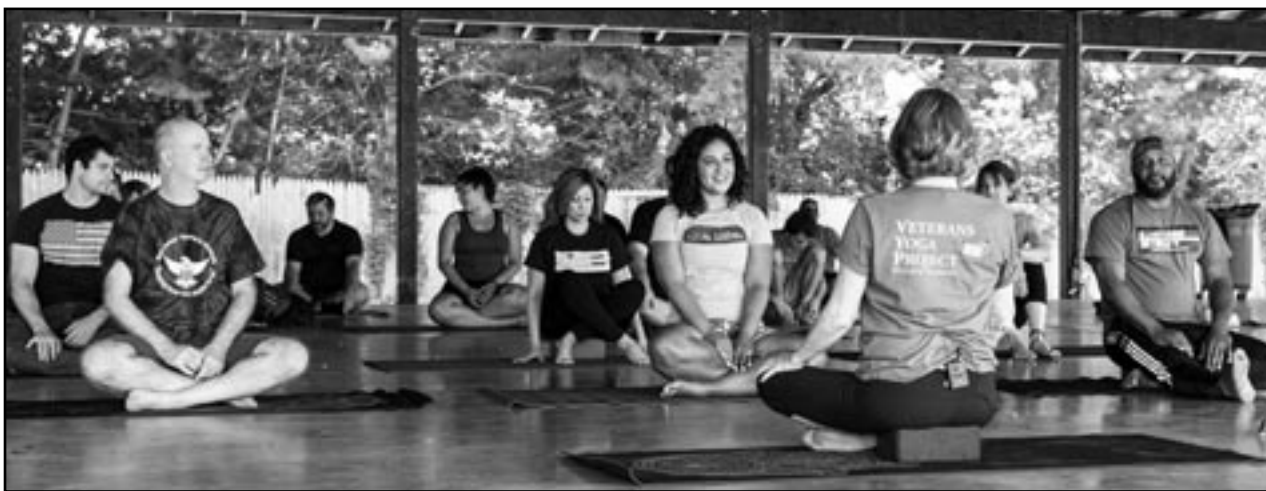
(above) The Veterans Yoga Project Video was filmed at a free event by the New Jersey Veterans Network for their web series, Local Legends.

If you are a veteran or family member that is in need of assistance, or are interested in joining our team, would like us to speak at your event, or contribute to our mission, call 973-332-1556 or email mdbollio@optonline.net . To learn more visit njvn.org .