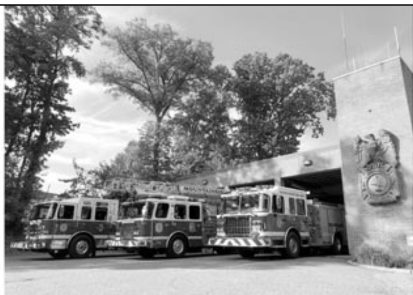
Mountainside Fire Department