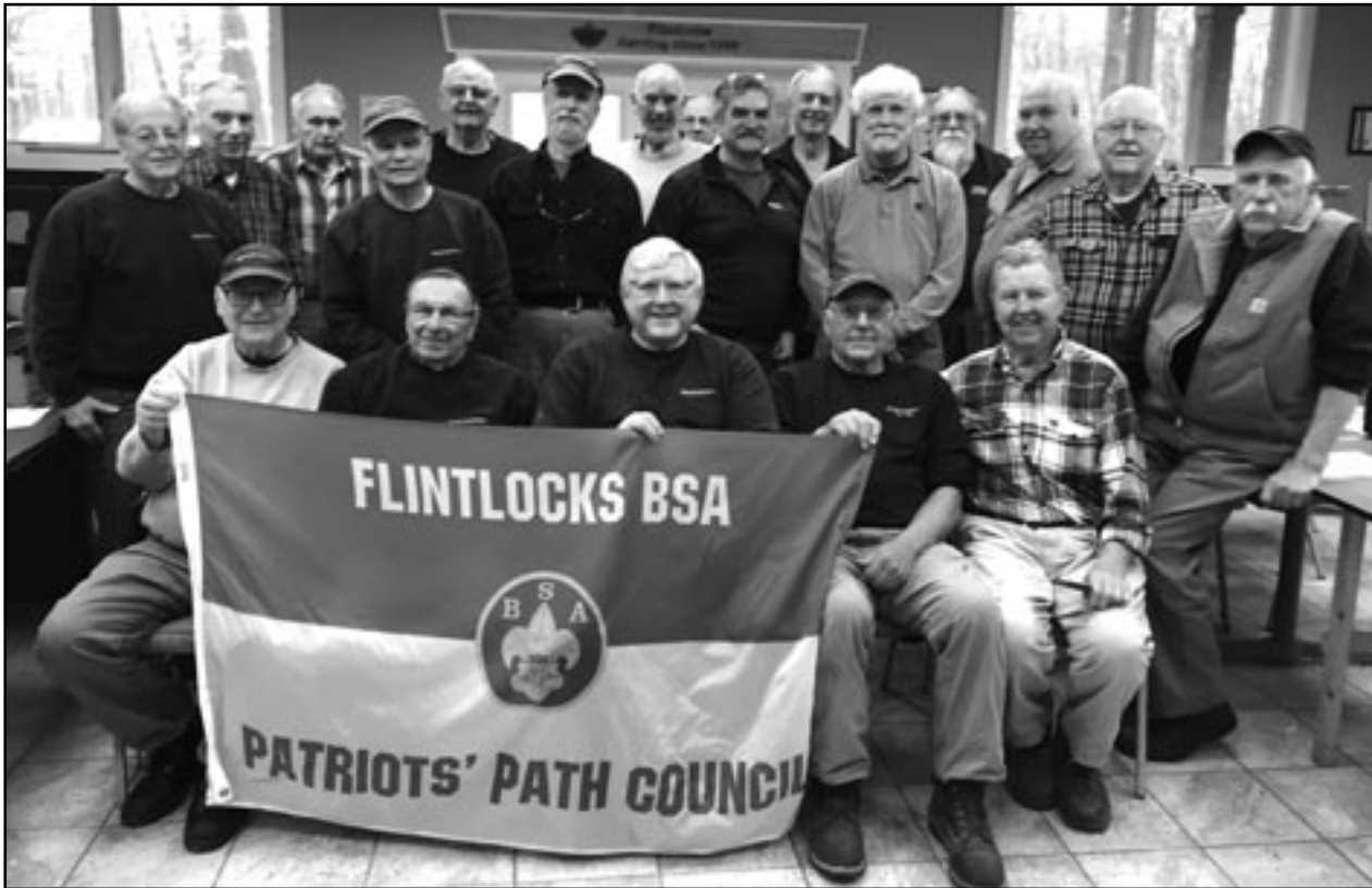
(above) Flintlocks pictured during their Annual meeting.