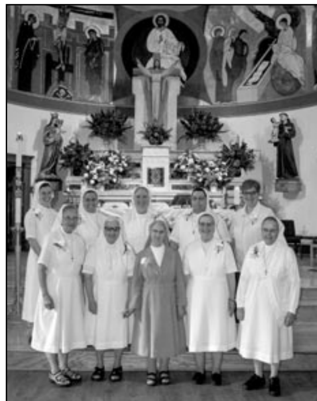
(above) A Mass and celebration were held on Saturday, June 4, at St. Anthony's Church in Elizabeth to celebrate the 150th Anniversary of the founding of the Salesian Sisters. The Salesian Sisters currently teach at St. Theresa School in Kenilworth, NJ.

A special thanks to our St. Anthony's Committee who worked so hard to prepare for this once-in-a-lifetime event.