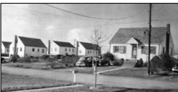
(above) Fairfield Ave. home, ca. 1942-43. Ashwood Ave. homes on left taken by Parkway.