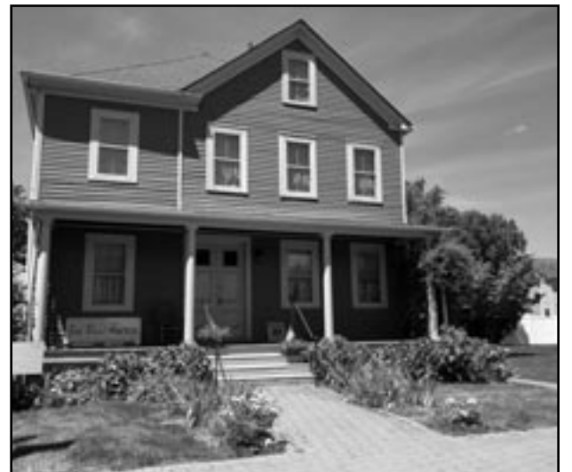
(above) The historic Oswald J. Nitschke House (c. 1880) at 49 South 21 Street, Kenilworth, N.J., will be open to the general public on October 15 and Oct. 16 (12-5 p.m.). Exhibits and music will focus on the theme "New Orange/Kenilworth – A Melting Pot of Many Cultures." Admission is free.