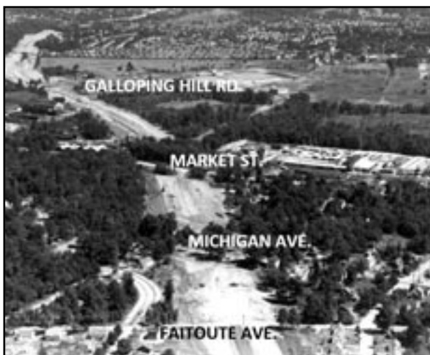
(above) Parkway construction, ca. 1949-50.