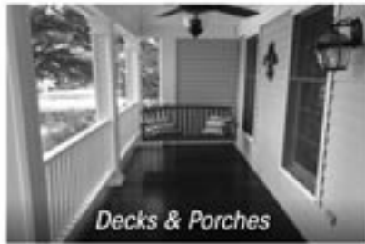
Decks & Porches