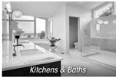
Kitchens & Baths