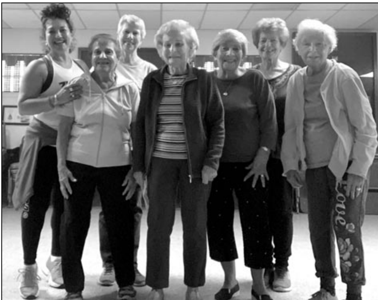
(above) Garwood seniors enjoyed a sun catcher painting program that was held on September 8 at the Garwood Knights of Columbus.