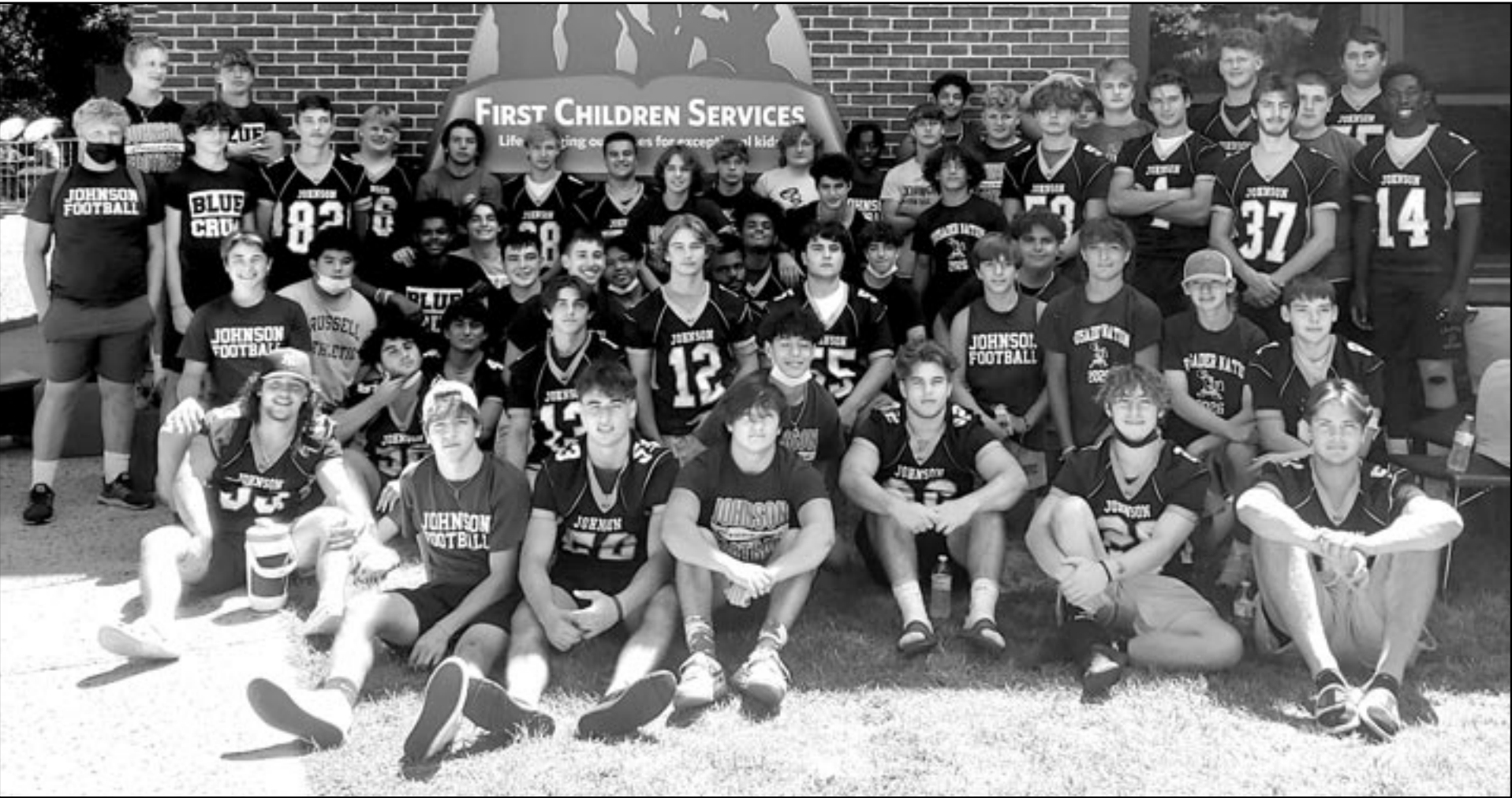
(above) The 2022 Arthur L. Johnson Crusader Football Team visited the First Children’s School on Friday, August 12, 2022.