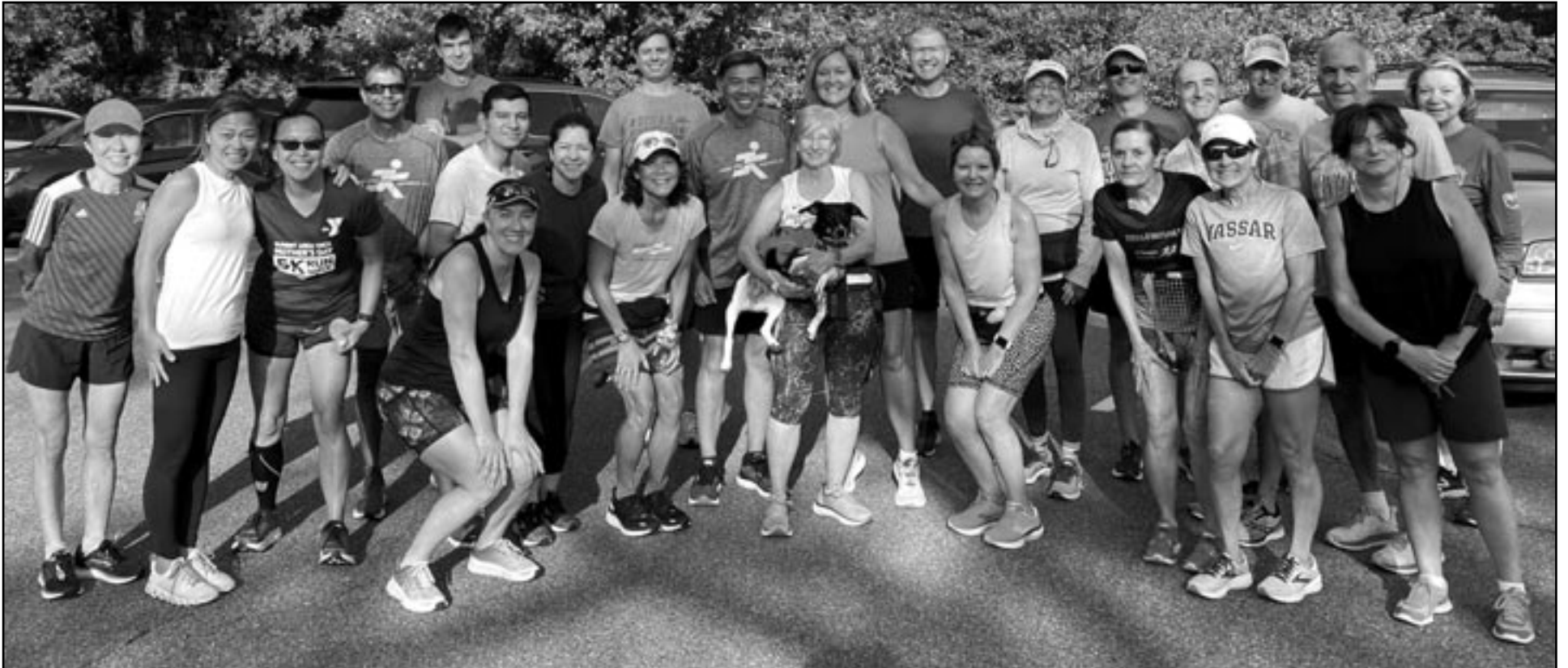
(above) The Rose City Runners are pictured during their Saturday club run on September 17.