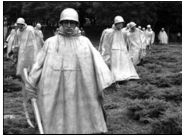
(above) Korean War Memorial.

If you have lost a medal, award or decoration, please visit the Veteran's Service Records section of the National Archives website.