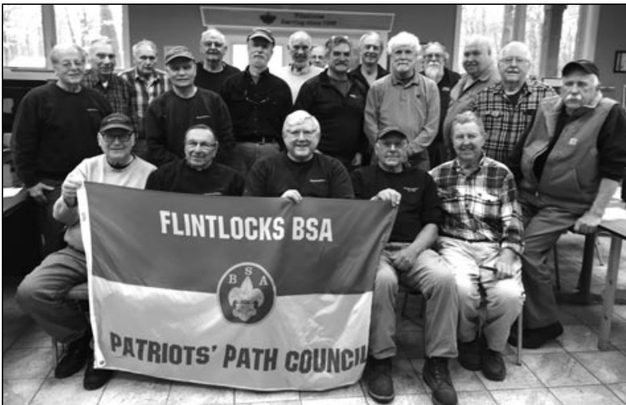
(above) Flintlocks pictured during their Annual meeting.