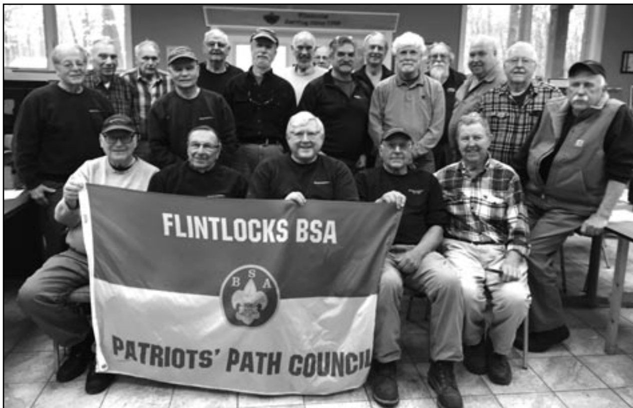
(above) Flintlocks pictured during their Annual meeting.