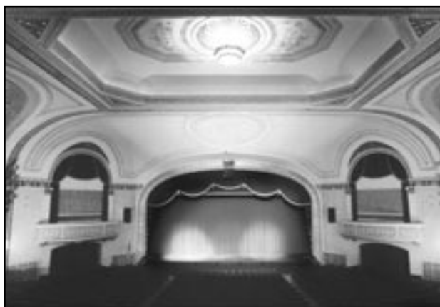
(above) Photo of Union County Arts Center, located in Rahway, NJ

Trail in Scotch Plains, and the Drake House Museum in Plainfield, as well as the smaller historical sites of the Woodruff House/Eaton Store Museum in Hillside and the Carter House