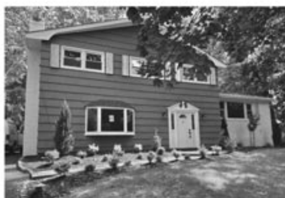
4 Nase Court, Warren, NJ 4 Bed | 2 Bath | 1 Half Bath | $699,000