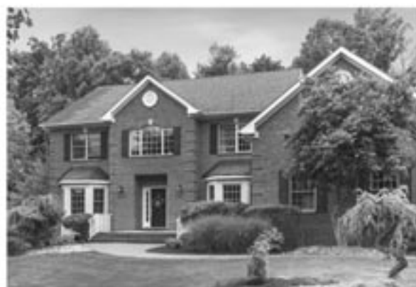
74 Briarwood Drive East, Warren, NJ 4 Bed | 3 Bath | 1 Half Bath | $1,195,000