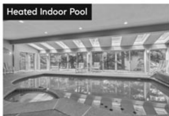
83 Old Stirling Road, Warren, NJ 5 Bed | 4 Bath | $1,245,000