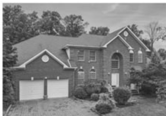
22 Schindelar Woods Way, Warren, NJ 5 Bed | 4 Bath | 1 Half Bath | $1,239,000