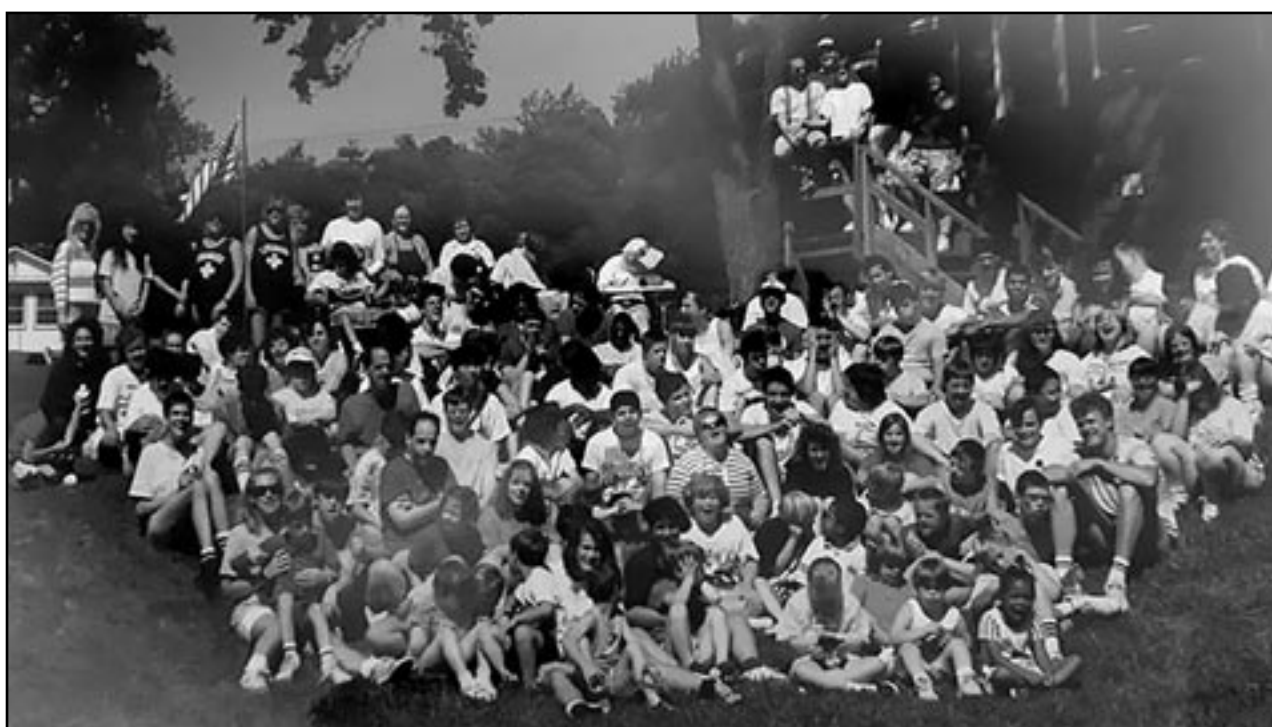
(above) The Arc Foundation of Somerset County will be hosting their 5th Annual "Clubs for Cabins" Golf Outing fundraiser on Monday, September 12, at Raritan Valley Country Club in Bridgewater Twp. This fundraising efforts support the renovation of Camp Jotoni, a 15-acre summer camp program for special needs children and adults of all ages.