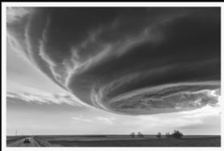
SUPERCCELL STORM CLOUD

near Julesburg, Colorado