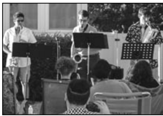
(above) Saxophone Trio Ensemble