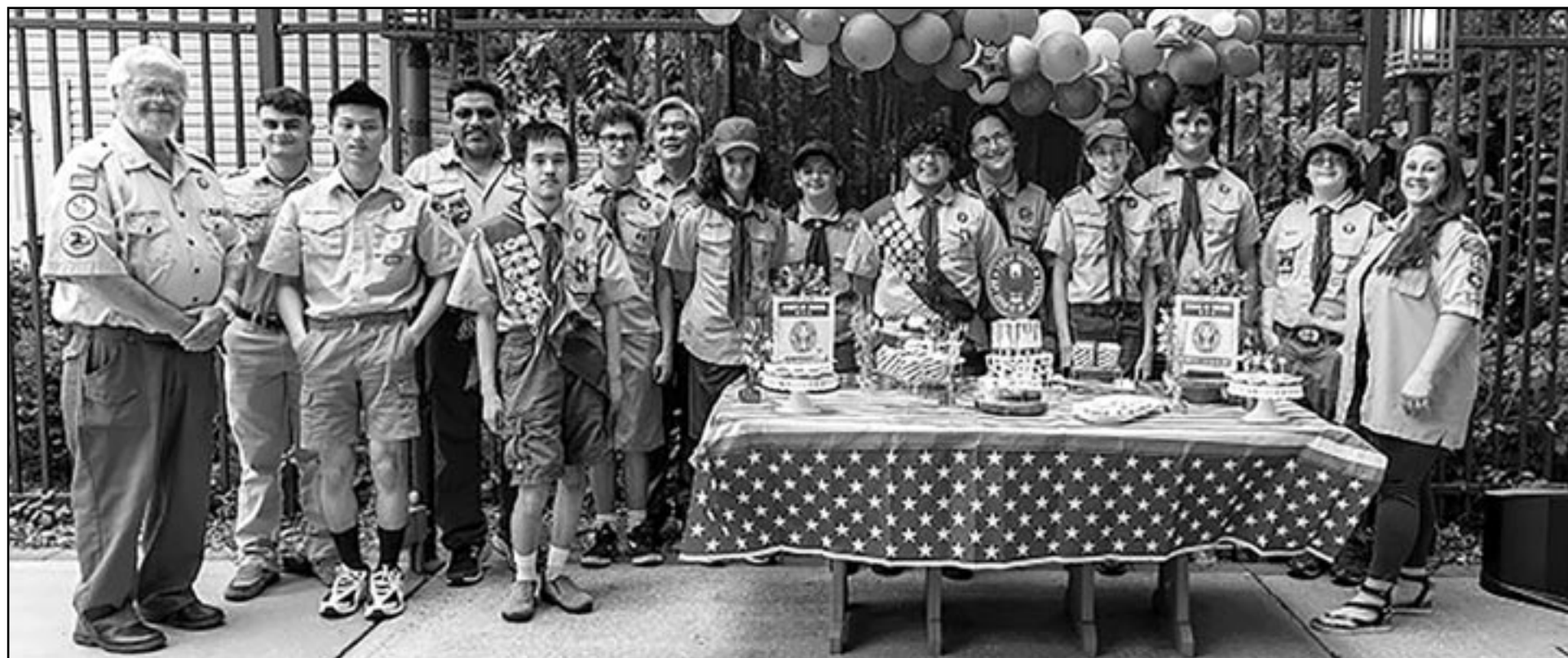
(above) Troop 56 is always welcoming new members. To learn more about scouting in Roselle Park, visit www.beascout.org .

Troop 56 is always welcoming new members. To learn more about scouting in Roselle Park, visit www.beascout.org .