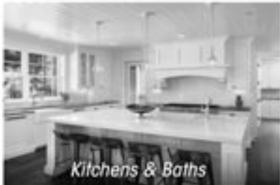
Kitchens & Baths