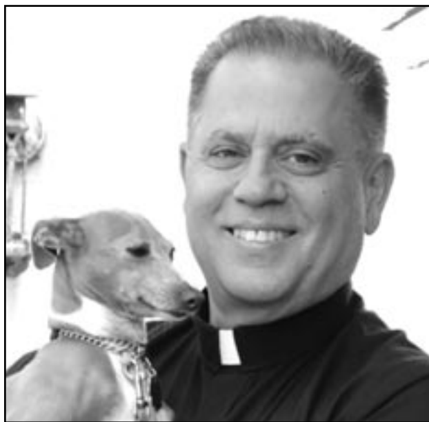
(above) Come and welcome Father to Roselle Park and the parish of the Church of the Assumption on September 24, 2022, at the 5:30 p.m. Mass.