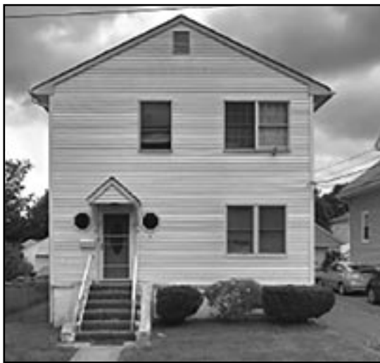
9 Garden Place, Cranford

Wow! All over New Jersey Jill Guzman Realty makes it happen.