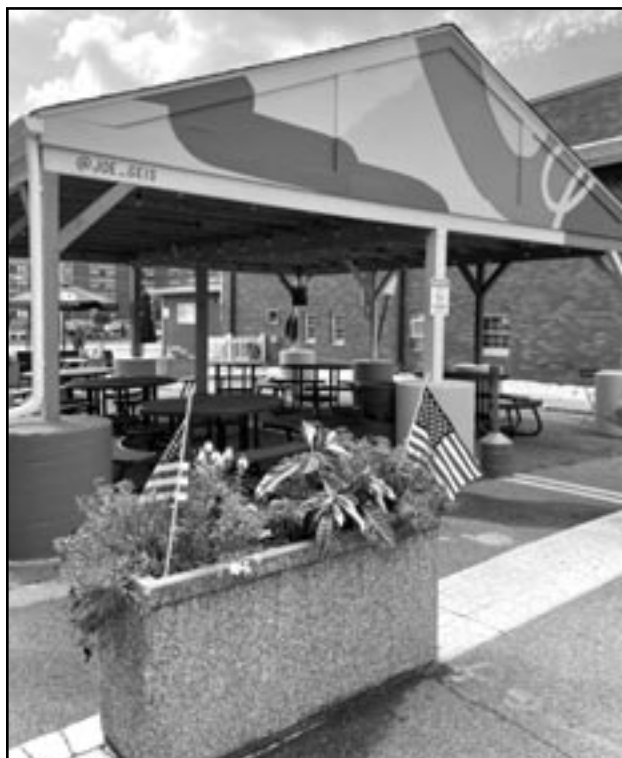
(above) The Lewis Street Pavilion is located in the beautiful downtown area of Rahway, NJ between Main and Augusta Streets.

Be sure to follow @Rahwayishappening on Instagram and Facebook to find out who will be there each week.