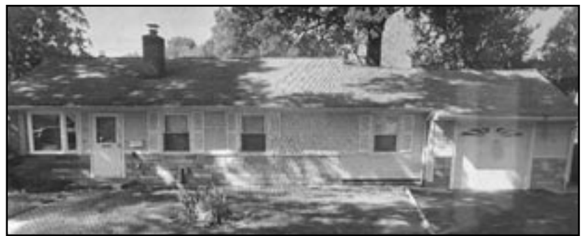
443 Raleigh Rd, Rahway