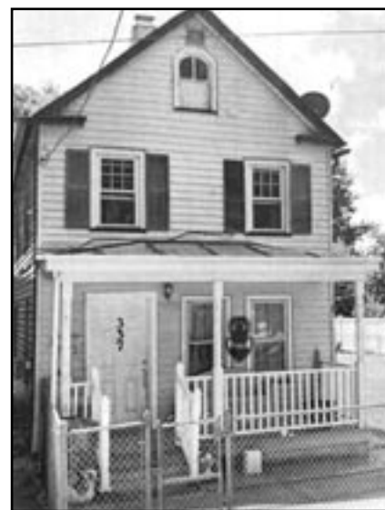
337 Lafayette St, Rahway