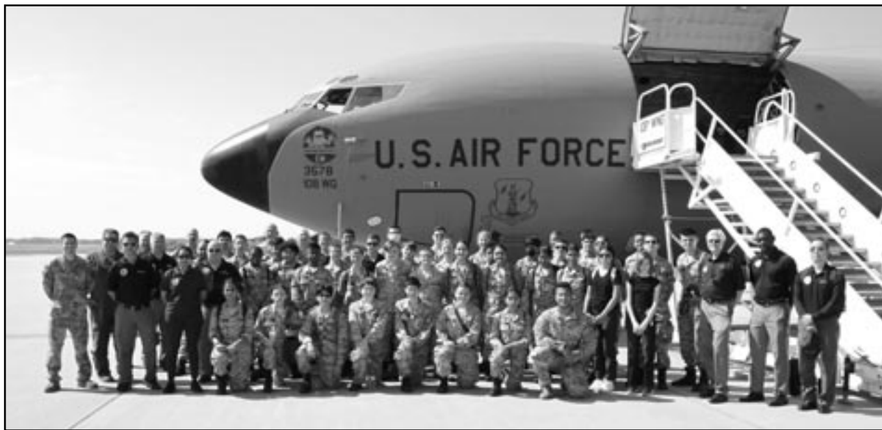
(above) On September 13, the Civil Air Patrol (CAP) will have an Open House event open to the public for the youth and adults.