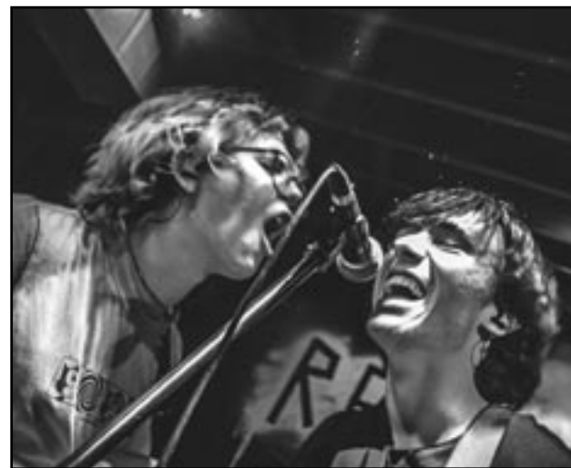
(above) Rahway-based band The New You have had a busy year recording and releasing new music. Their debut single, "Make You Mine," can be heard on all major streaming services.