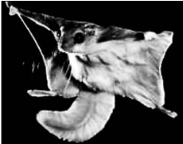
(above) Flying squirrels are more common than we think, nesting in trees during the day and gliding overhead from tree to tree at night.

Flying squirrels are a third, adaptable type of squirrel. They live something like birds do, in nests or tree holes, and although they do not fly, they can really move across the sky. Flying squirrels glide, extending their arms and legs and coasting through the air from one tree to another. Flaps of skin connecting limbs to body provide a wing-like surface. These gliding leaps can exceed