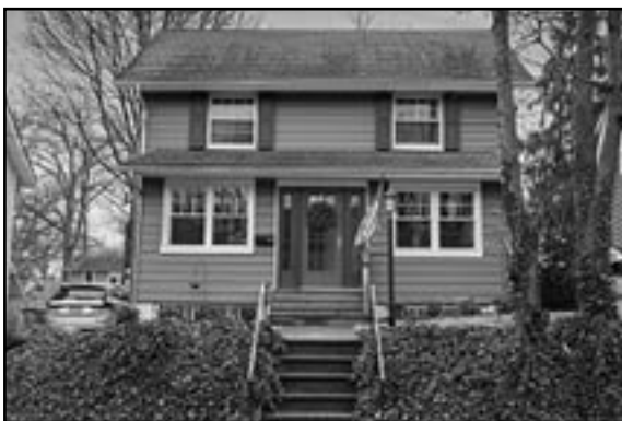
83 Laurel Avenue, Bloomfield