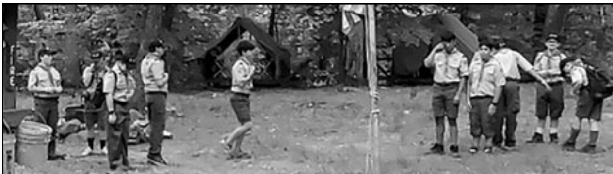
(above) Boy Scout Troop 23 prepares for a nightly flag retreat ceremony in its campsite at Winnebago Scout Reservation during its annual summer camp.

For more details, please contact Dan Bernier, Scoutmaster, at 908-451-1948 or homeinthepark1@comcast.net .