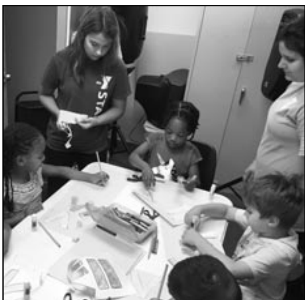
(above) Registration is open for the 2022-2023 school year Before and After School Programs offered by The Gateway Family YMCA.

children, especially as they continue to adjust to the many changes related to COVID-19.