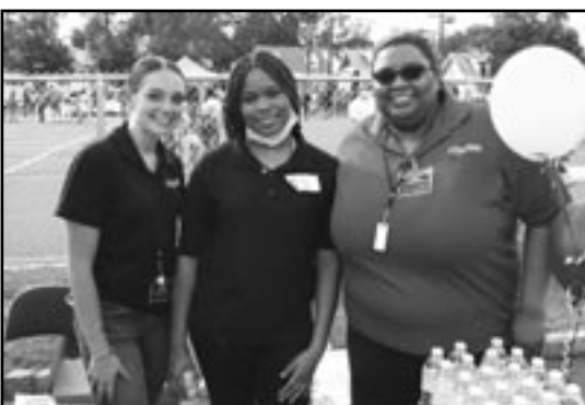
(above) ShopRite Village Supermarket