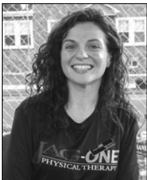
(above) JAG One