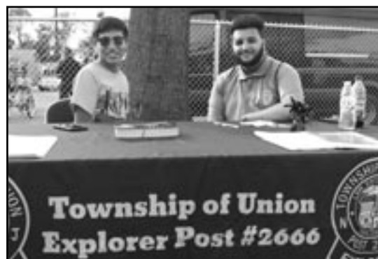
(above) Police Explorers - Post # 2666