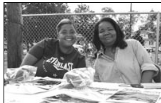
(above) Law Enforcement Against Drugs

Photos from 2021 National Night Out can be found online at rennamedia.com and on Spirit of Union page on facebook.com . Feel free to “Like,” “Tag,” and “Share.”