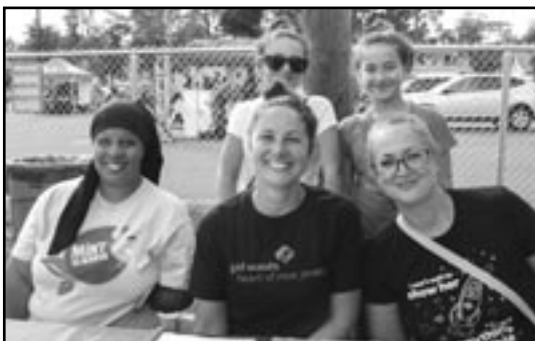
(above) Girl Scouts of Union