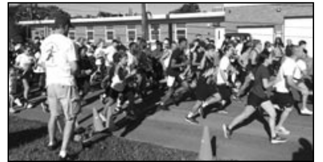
(above) The 2022 Mayor's Day 5K Run will be held on Sunday, September 25. To register, visit runsignup.com .