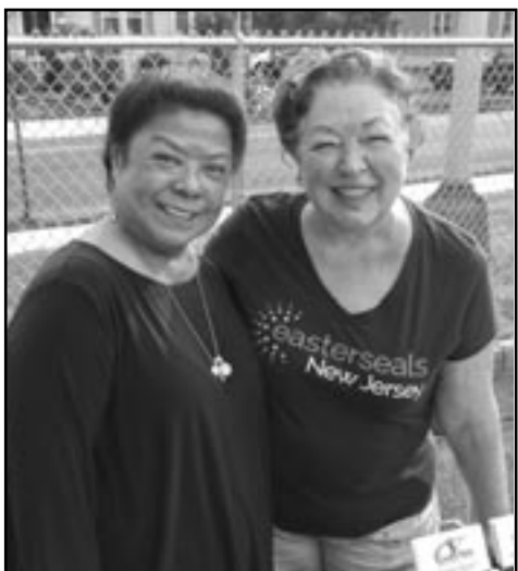
(above) Center Path Wellness