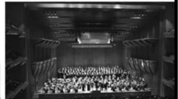
On tour with Turksoy Orchestra at Lincoln Center