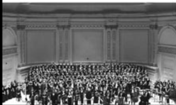
Carnegie Hall Choirs-in-Residence with Maestro John Rutter