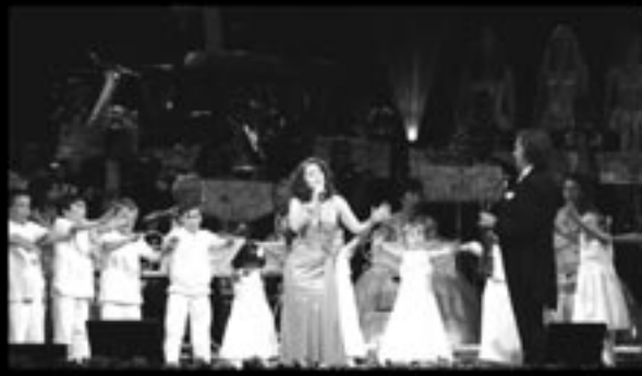
On tour with André Rieu and the Johan Strauss Orchestra