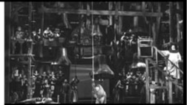
Hunchback of Notre Dame World Premiere at Paper Mill Playhouse