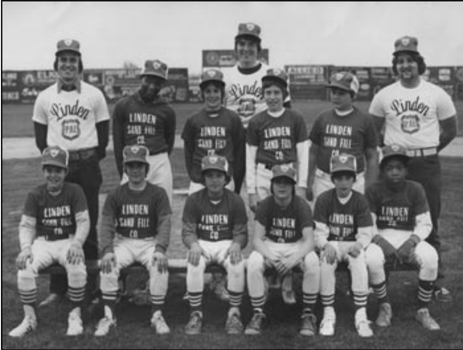
1978 P.A.L. LITTLE LEAGUE