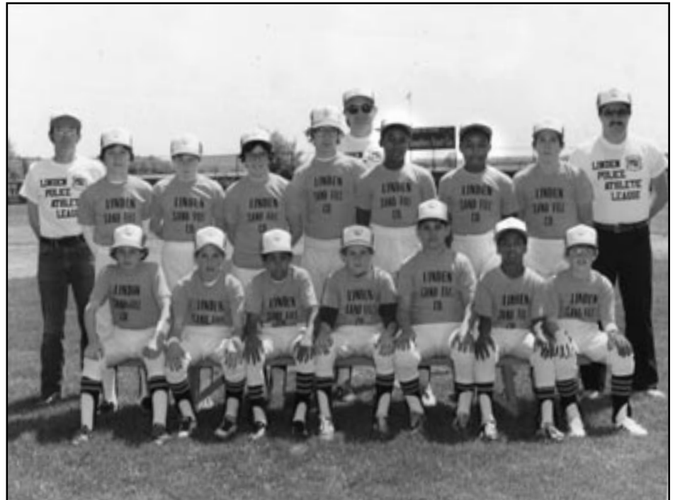
1981 P.A.L. LITTLE LEAGUE