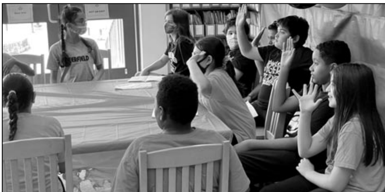
(above) STEAM4: Students from Schools No. 4 and No. 9 in Linden responding to judges' questions during their virtual presentation in the finals of the statewide STEAM Tank Challenge on May 20. The team won awards for Arts and Creativity; J.E.D.I. (Justice, Equity, Diversity, Inclusion); and Social-Emotional Learning.