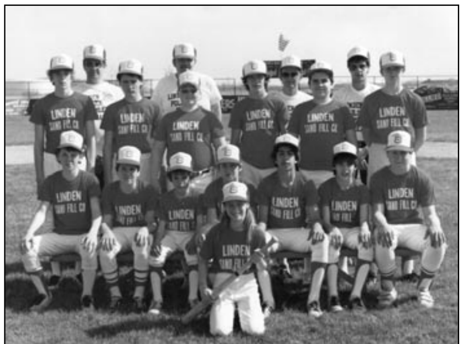
1984 P.A.L. LITTLE LEAGUE

Photos from this and other events can be found online at rennamedia.com and on the Life in Linden page on facebook.com . Feel free to “Like”, “Tag” and “Share”.