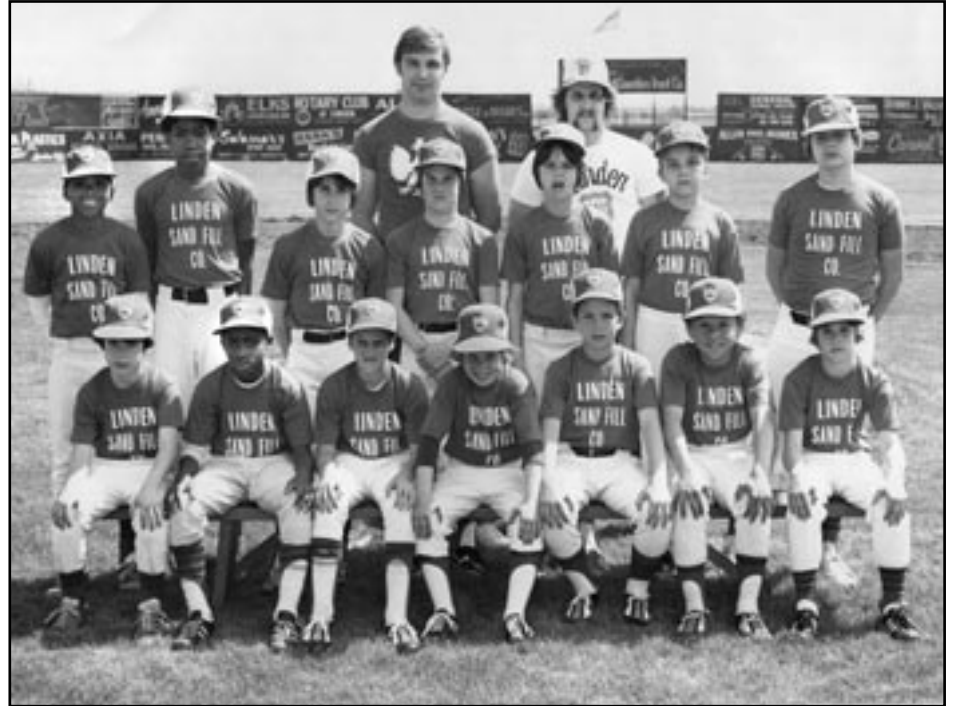
1979 P.A.L. LITTLE LEAGUE