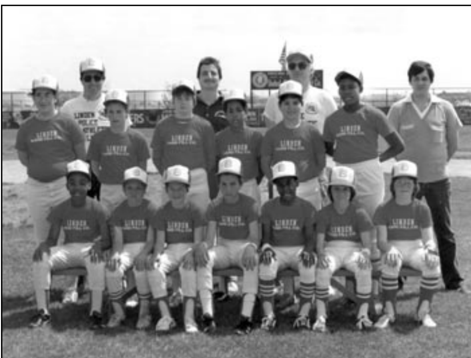
1982 P.A.L. LITTLE LEAGUE