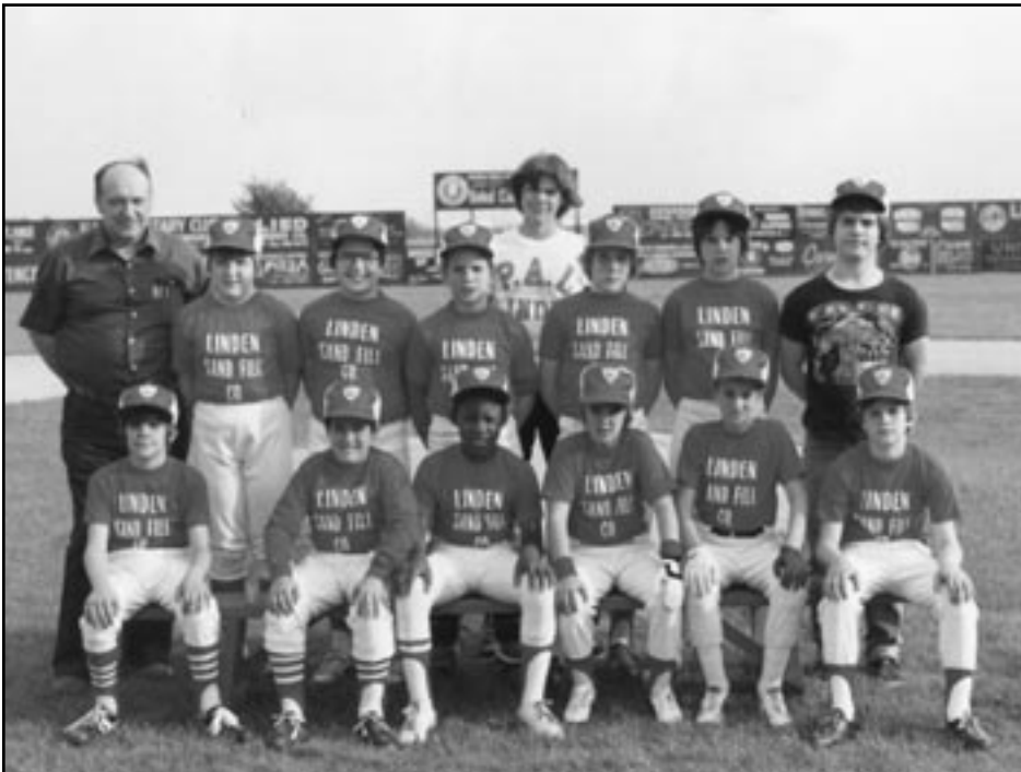
1980 P.A.L. LITTLE LEAGUE