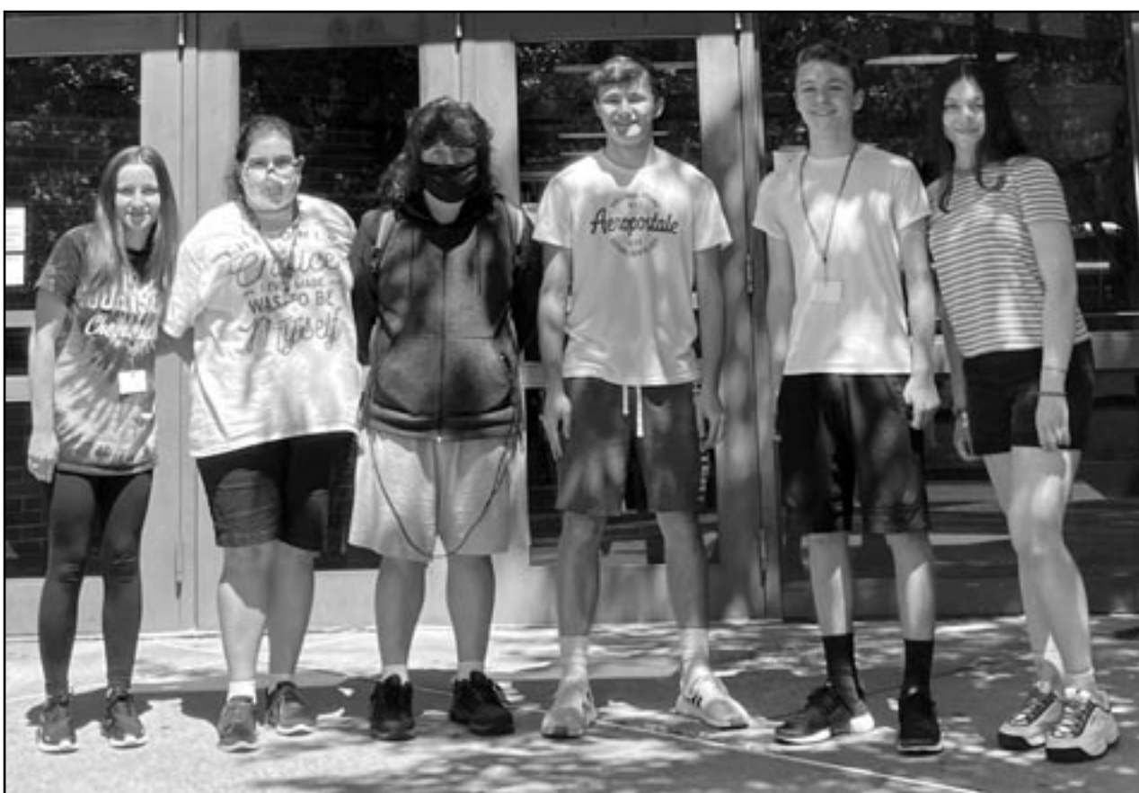
(above) A few of the ALJ students who attend the Shared-Time Union County Career & Technical Institute Program at Union County Vocational Technical Adult School.