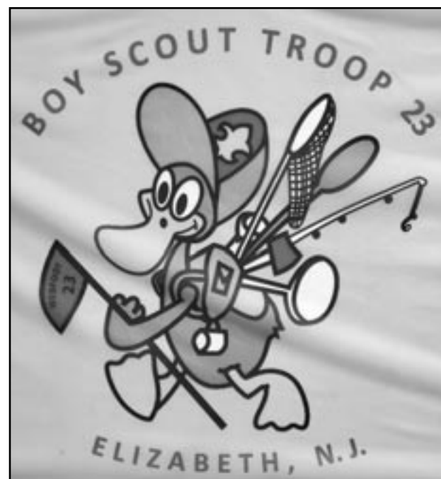
(above) Boy Scout Troop 23 will celebrate its 60th Anniversary on Saturday, September 17. Troop 23 is known throughout the Scouting organization nationwide for its Webby Webfoot duck mascot and its iconic yellow t-shirts.