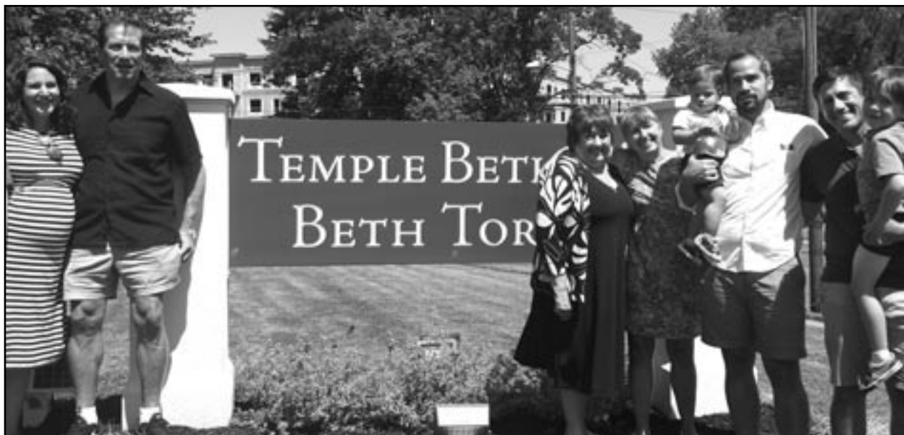
(above) The Rubin and Leibowitz Family

in Central New Jersey, noted for its warm and welcoming inclusivity, uplifting religious services and educational programs for children and adults. For more information, or to schedule a visit, contact Rabbi Stern or the Temple office at 732-381-8402, check the Temple Facebook page, or visit at bethorbethtorah.org.