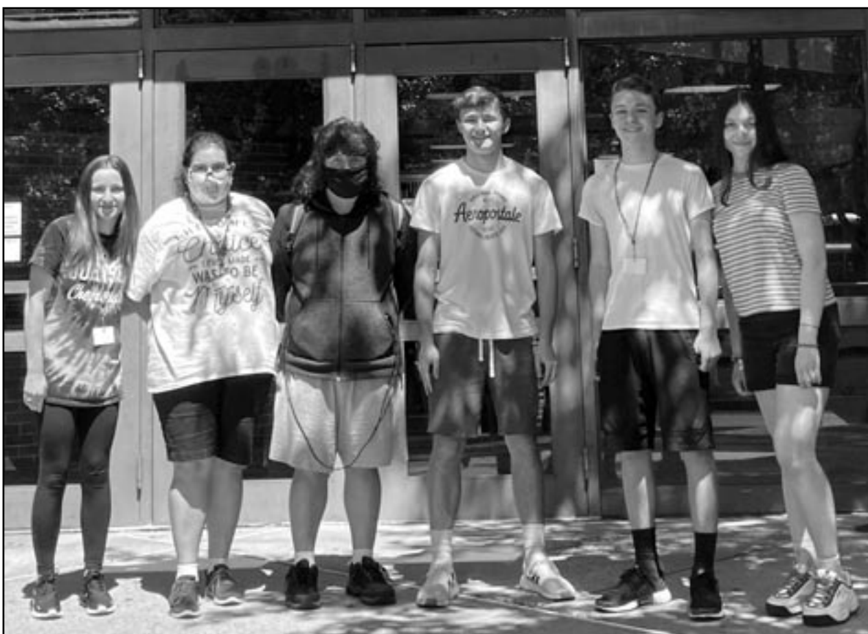
(above) A few of the ALJ students who attend the Shared-Time Union County Career & Technical Institute Program at Union County Vocational Technical Adult School.