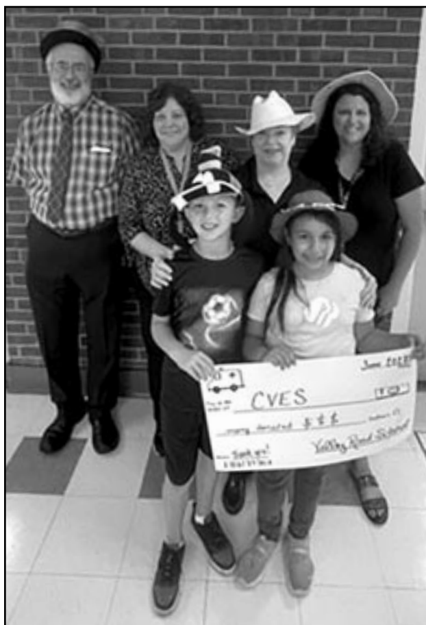
(above) Hats On Day raised funds for The Clark Volunteer Emergency Squad