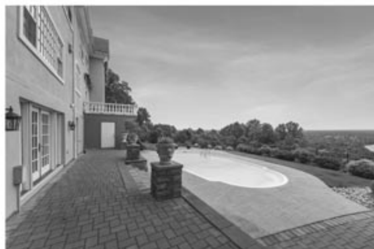
780 Johnston Drive, Watchung, NJ 5 Bed | 4 Bath | 3 Half Bath | $1,595,000