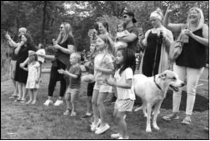
Photos from this and other events can be found online at rennamedia.com and on the Watchung Post page on facebook.com . Feel free to "Like," "Tag," and "Share."