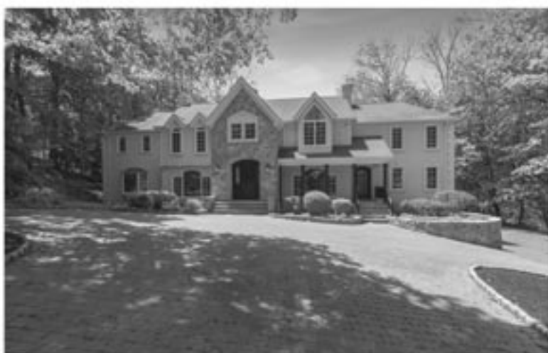
45 Hill Hollow Road, Watchung, NJ 5 Bed | 3 Bath | 3 Half Bath | $1,335,000