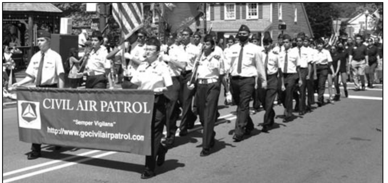
(above) Civil Air Patrol (CAP) NJ-102 Squadron participated in the Scotch Plains and Fanwood Memorial Day Parade.