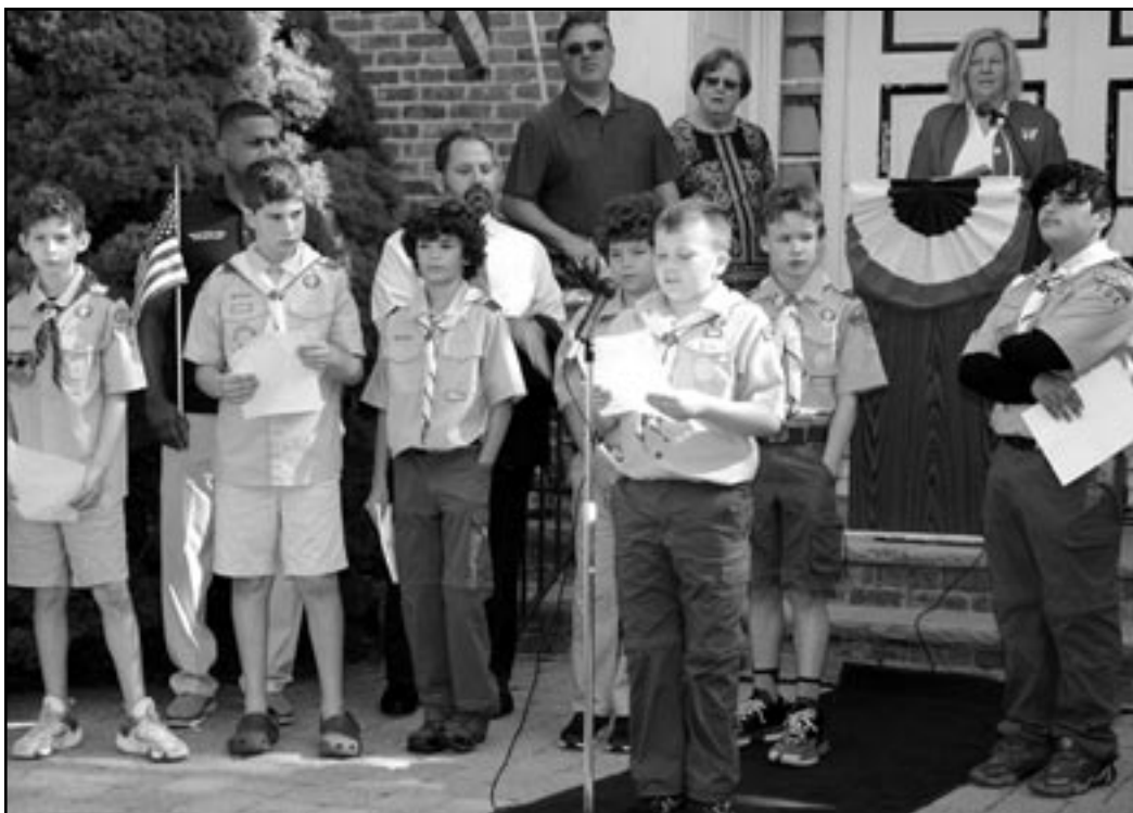
(above) Boy Scouts read the names of Gold Star veterans