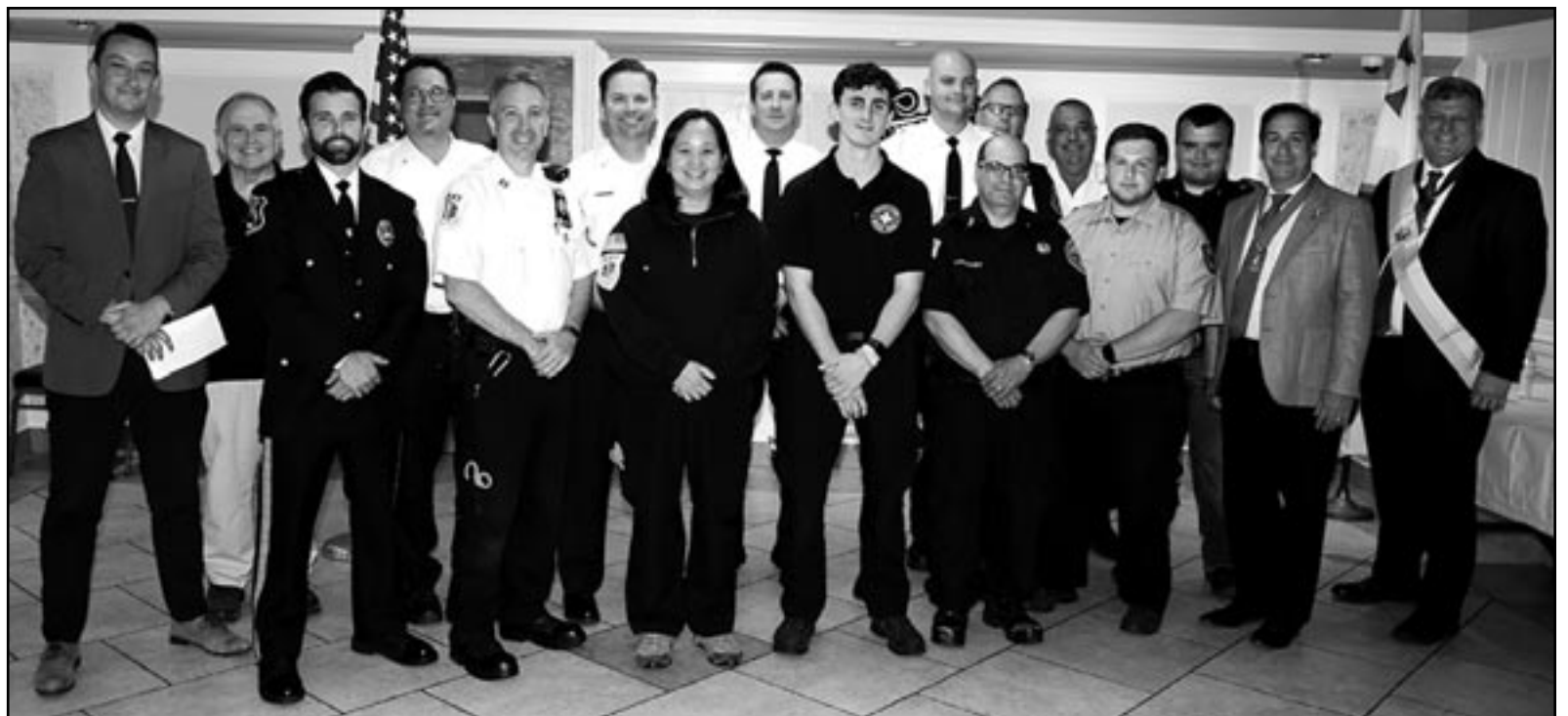
(above) Group photo of all honorees and their chiefs