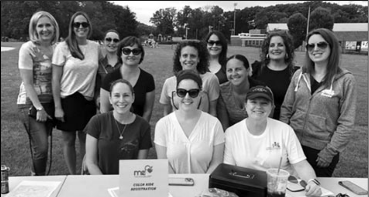
(above) Mountainside Education Fund Volunteers

Ride & Movie Night was held on Friday, June 10th. Partners for the event included the Mountainside PBA, Fire Co., Rescue Squad and The Watts Foundation.