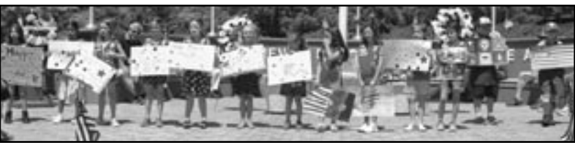
(above) Memorial Day Poster Contestants

PRSR STD U.S. POSTAGE PAID BRIDGEPORT CT PERMIT NO. 390