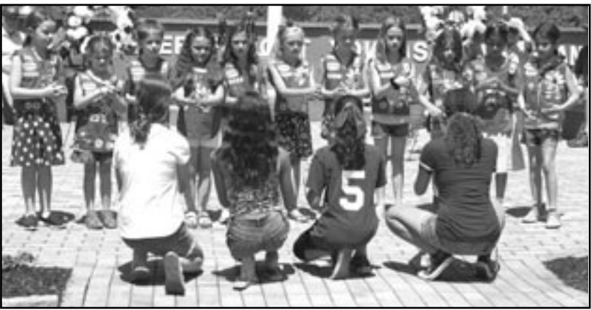
(above) Girl Scouts performed "God Bless America" in sign language.

Cyril left the crowd that day with one important question, "Are you proud to be an American?"