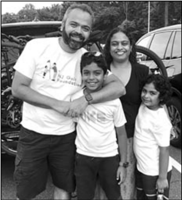
(above) The Pandya Family