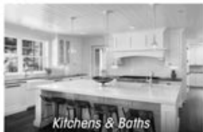
Kitchens & Baths