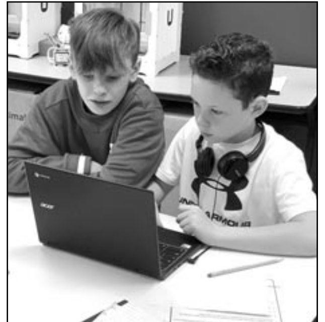
(above) Students work together in STEM (Science, Technology, Engineering and Math) class at Harding.

The alternate education program that launched in a school conference room moved to the new Brearley Annex. The modular classroom with free-flow spaces serves the needs of students who have difficulty in