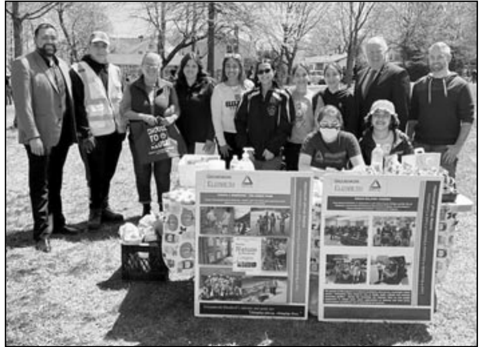
(above) Groundwork Elizabeth table exhibit