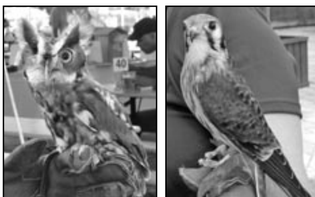
(above, l-r) Penny, a 9-year-old blind Eastern Screech Owl and Zizi, a female American Kestrel.

In our 39+ years, TRT has admitted over 130,000 birds for care. Spring and summer are our busiest time of year, and we're preparing for the adorable invasion of tiny Robins, Great Horned Owl fluffballs, and baby Blue Jays with an attitude, among hundreds of other youngsters.