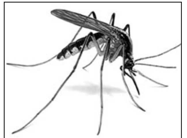
(above) The best organic mosquito control starts with eliminating breeding sources NOW and then following up after each rainfall. Car tires are our worst breeding areas.