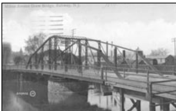
(above) After the Milton Avenue Draw Bridge was destroyed during the 1882 flood, this steel bridge was built. An overhead sign in the middle of the bridge read "Walk your horse or pay the fine." The brick support under the bridge remains to this day and supports the present bridge which was reconstructed in 2001.