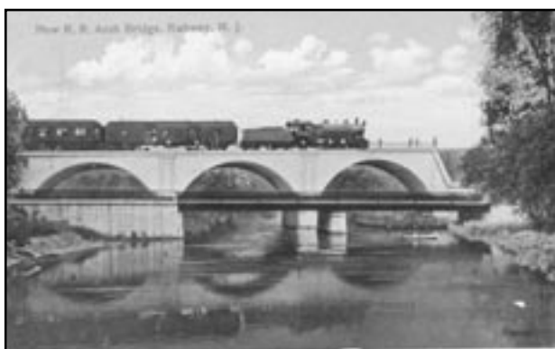
(above) A railroad bridge was constructed over the river in the 1830s when tracks were first laid in Rahway. In 1875 an iron bridge was built. It was reported to be the first four track iron bridge built in the United States. When the tracks were elevated (1911-1914) this new 3-arch concrete bridge was constructed.

Most of the bridges that stand today have been reconstructed and/or redesigned several times over the years. Sixteen of the bridges were destroyed or badly damaged during the great flood of September, 1882, the worst in Rahway's history. After destroying the Milton Avenue Bridge, raging waters, travelling at 15-25 miles per hour and carrying lumber, canal boats, and heavy debris, slammed into the Monroe Street Bridge sweeping one person to his death. Each bridge from Monroe all the way to St. Georges, on both the main branch and the Robinson's Branch, was totally lost or severely damaged. The western half of the St. Georges Avenue Bridge near River Road collapsed. The St. Georges