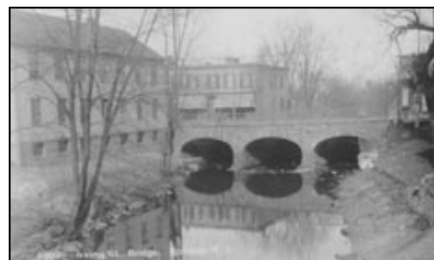
(above) The picturesque Irving Street Bridge (photo circa 1900) looking east from Hamilton Street. The surface was "modernized" in 1924 with concrete sides. The bridge is presently under reconstruction after being damaged by flood waters this past fall. Perhaps, when redesigned, it will be brought back to its original charm.