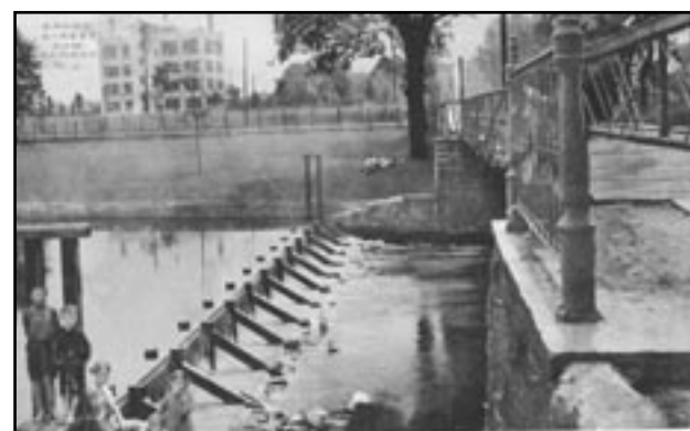
(above) Photo (circa 1914) shows the Grand Avenue Bridge when it was a truss bridge. The small dam was built in 1912 to keep the river at a depth that would allow for swimming and rowboats. The concrete arch bridge that stands today was built in 1917. Note the Wheatena building at top left.

Visit The Merchants and Drovers Tavern Museum 1623 St. Georges Avenue, Rahway, NJ online at: merchantsanddrovers.org