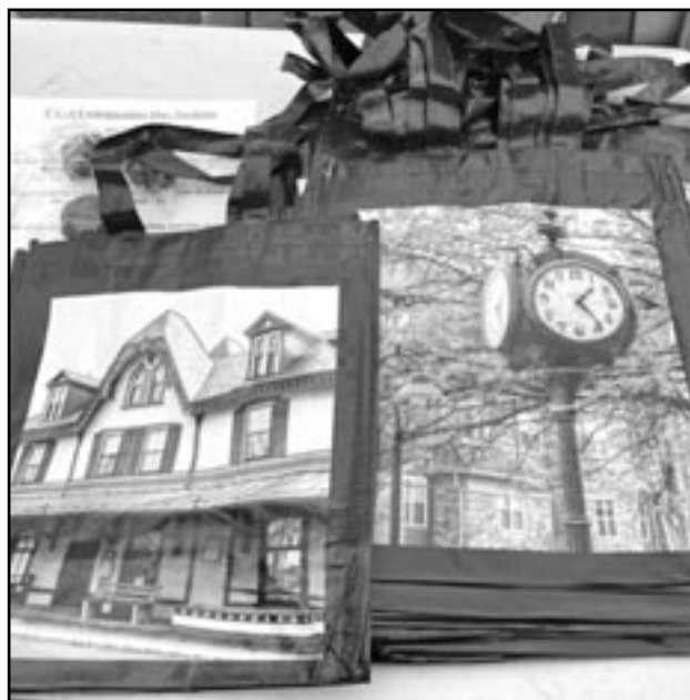
(above) Free reusable grocery bags with iconic Fanwood images