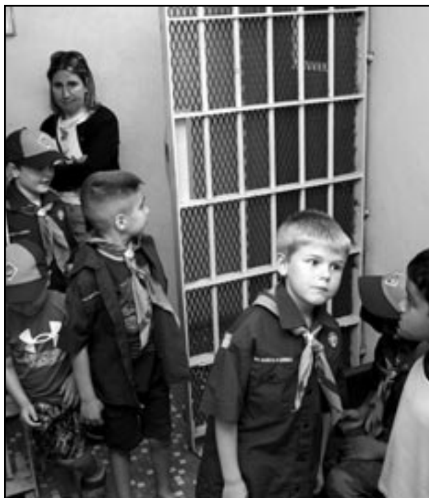
(above) Visiting the lock-up