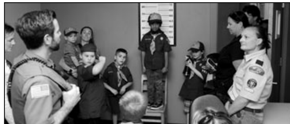
(above) Mug shot area