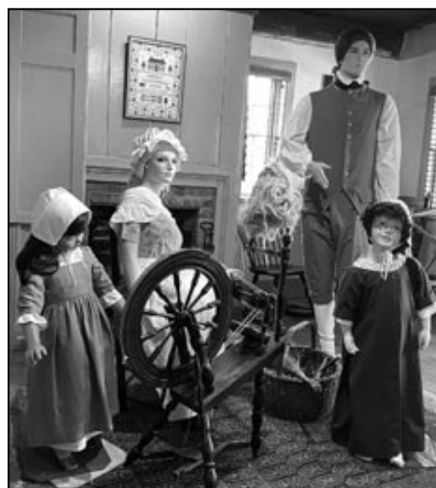
(above) A Colonial Children's Day celebration will be held on Sunday, June 5th between 2 - 4 p.m., at the Osborn Cannonball House Museum, located at 1840 Front Street, Scotch Plains, NJ.

On Sunday, June 5th between 2 - 4 p.m., come visit the Osborn Cannonball House Museum, located at 1840 Front Street, Scotch Plains, NJ. Step back in time to experience the simple joys of childhood. Costumed docents will provide hands-on activities, including crafts, and stories for your fun and participation in our Colonial Children's Day celebration!