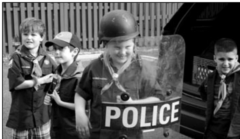
(above) Scouts got to try on equipment