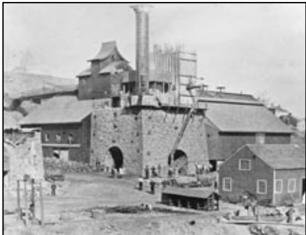
(above) The Boonton Iron Works c. 1880. Historians invite the public to contribute historic photos to the online exhibit "Morris County's Miners."