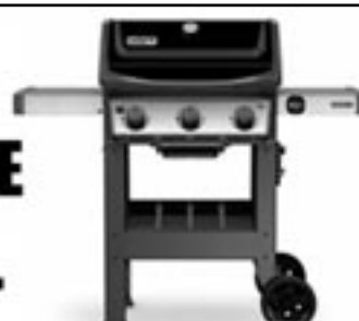
Spirit II E-310 Gas Grill LP Gas $639.00

WEBER PRE-SEASON SALE ENDS MEMORIAL DAY WEEKEND