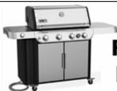
GENESIS S-435 Gas Grill Natural Gas $1749.00

*****ECRWSEDDM***** POSTAL PATRON MADISON, NJ 07940