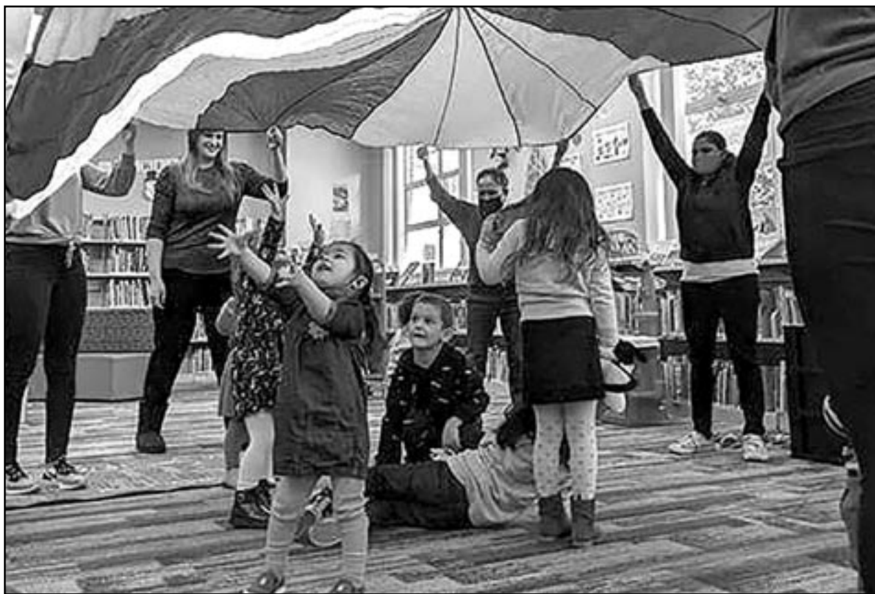
(above) Roselle Park Veterans Memorial Library holds a host of fun and educational programs for children, tweens, teens, and adults. Discover the possibilities at lmac.ent.sirsi.net/client/en_US/rospark/ .