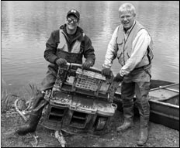
(above) Some interesting things have been pulled out of the river during the annual Earth Day River Clean-up events

All volunteers are invited to celebrate Earth Day 2022 with Boy Scout Troop 330, Cub Scout Pack 30 and members of the Rahway River Watershed Association in a clean-up of the Rahway River on Saturday, April 23rd (with a rain date of Sunday, April 24th). The clean-up