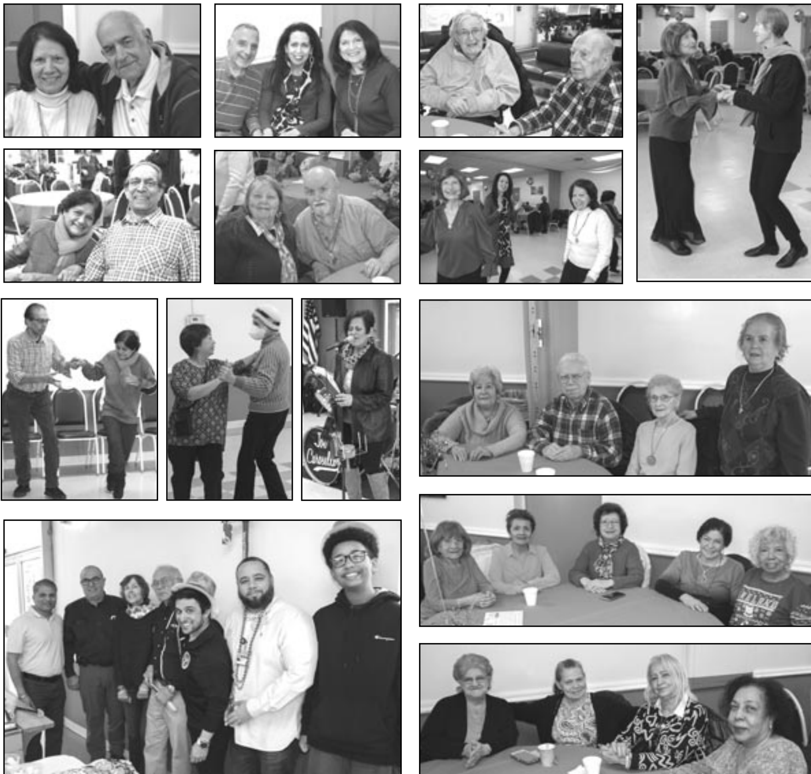
Photos from this and other events can be found online at rennamedia.com and on Roselle Park Monthly page on facebook.com . Feel free to "Like," "Tag," and "Share."