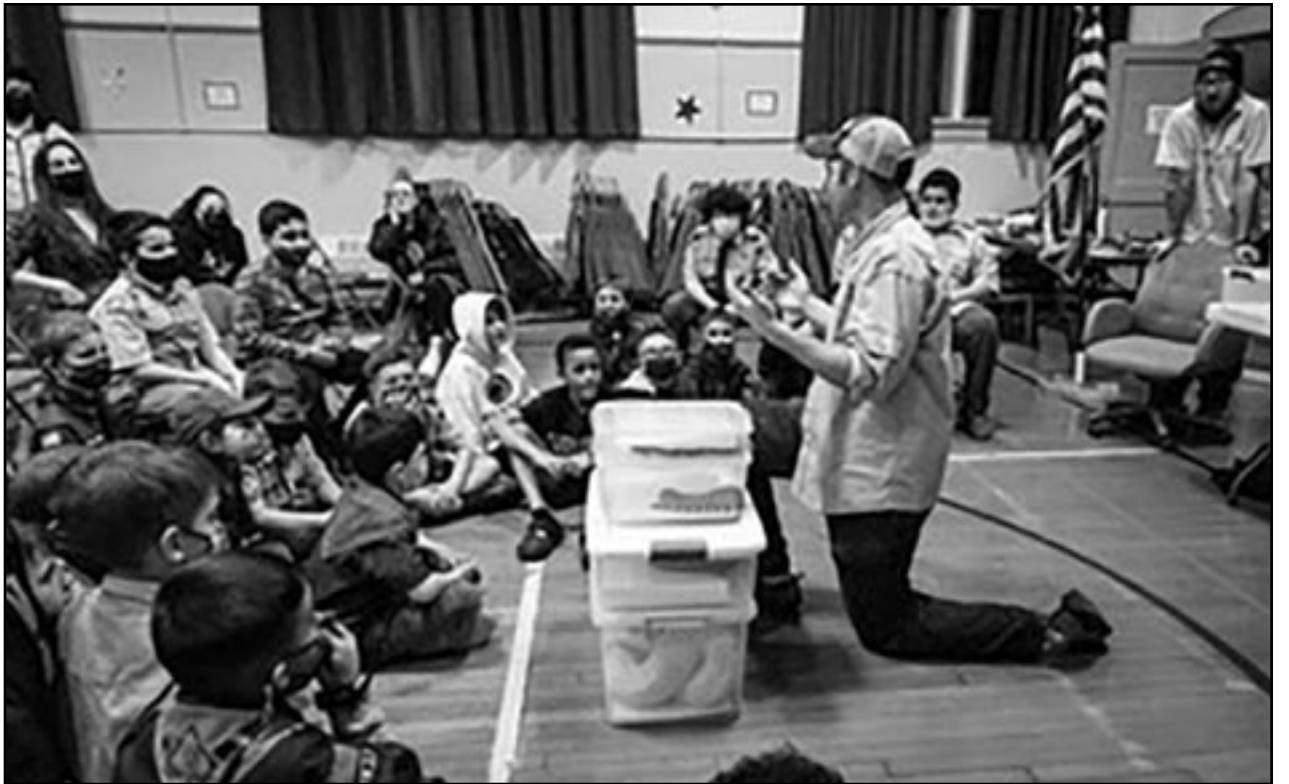
(above) NJ Snakeman entertains and educates Cub Scout Pack 56 to the delight of all attendees.