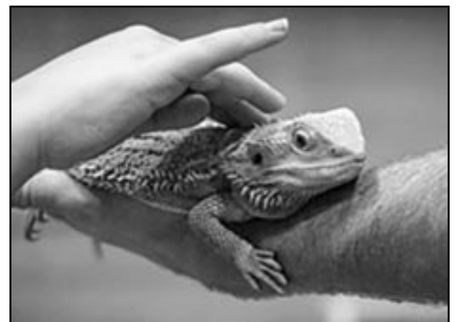
(above) Cub Scouts of Pack 56 pet a Bearded Dragon at a recent presentation by NJ Snakeman.