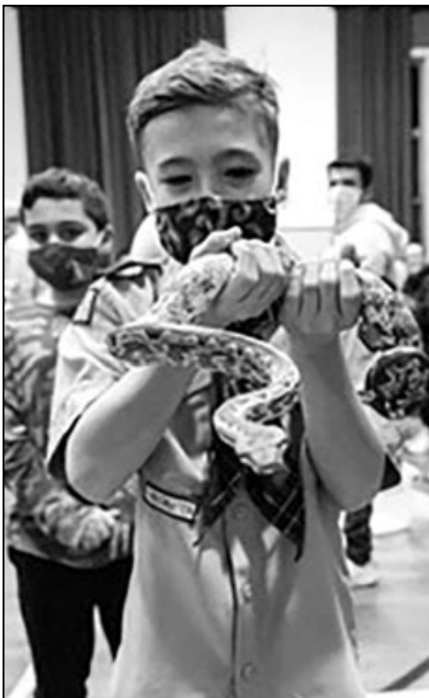
(above) Scouts of Pack 56 line up to take a turn holding snakes and other reptiles provided by NJ Snakeman.