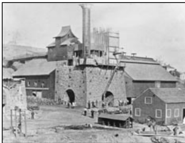
(above) The Boonton Iron Works c. 1880. Historians invite the public to contribute historic photos to the online exhibit "Morris County's Miners."