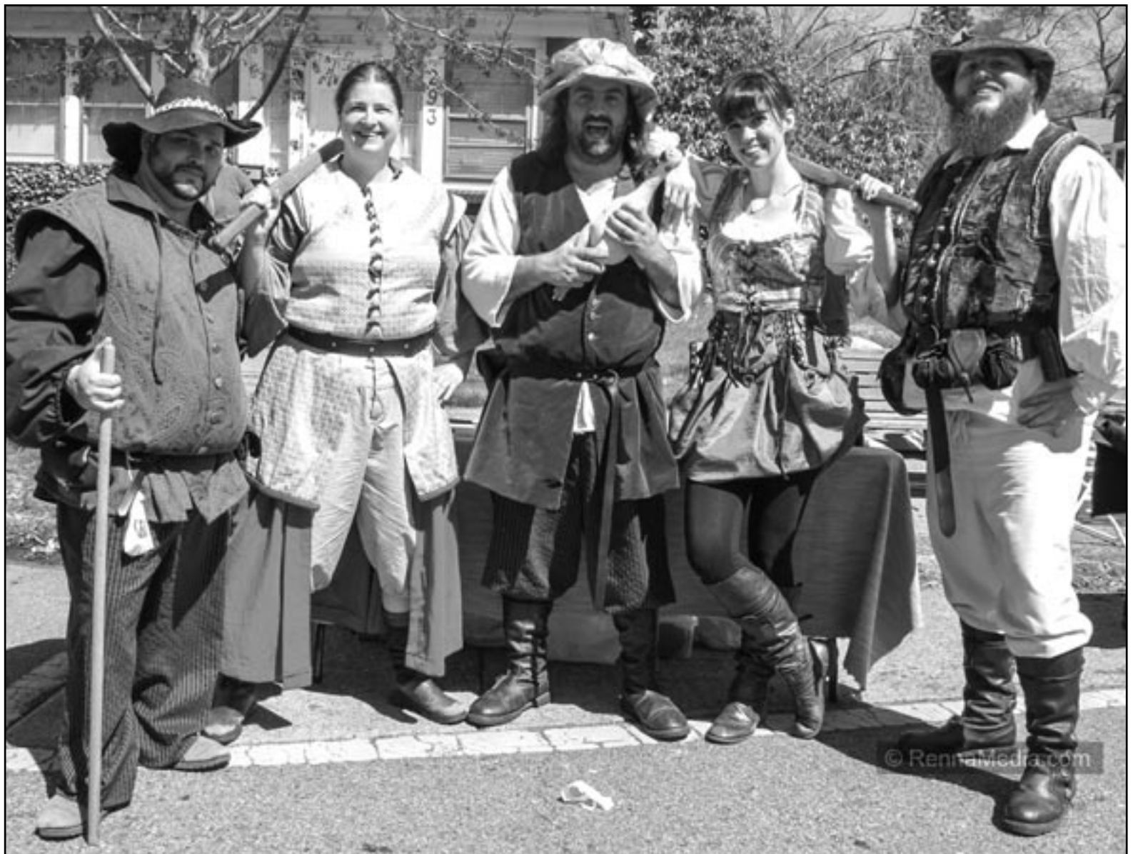
(above) The 20th Annual Stirling Street Fair will be held on Sunday, April 24, 2022, from 10 a.m. to 5 p.m. on Main Avenue in Stirling.

The Long Hill Chamber of Commerce is an organization dedicated to supporting and promoting the local businesses in our community. Through regular meetings and networking events, members share ideas and concerns unique to Long Hill Township, which includes Millington, Stirling, Gillette and Meyersville. Visit longhillchamber.com for more information.