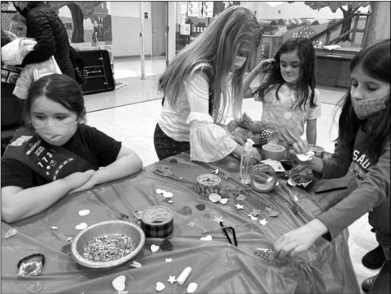
(above) Millington School provides the perfect space for 100 Long Hill Girl Scouts of a variety of ages to create SWAPS—Special Whatchamacallits Affectionately Pinned Somewhere.

table creating unique and fun SWAPS. These SWAPS will be exchanged at future Girl Scout events, serving as both icebreakers and tokens of friendship. In the Girl Scout spirit of giving back, participants brought non-perishable food items to the SWAP, resulting in a considerable donation to our local Twelve Baskets Food Pantry. Special thanks to Millington School for providing the ideal space for this popular event.