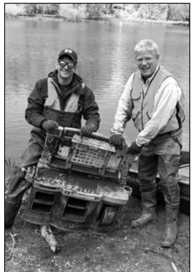
(above) Some interesting things have been pulled out of the river during the annual Earth Day River Clean-up events

Instagram @DefendOurTreesNJ to see other sites and locations.