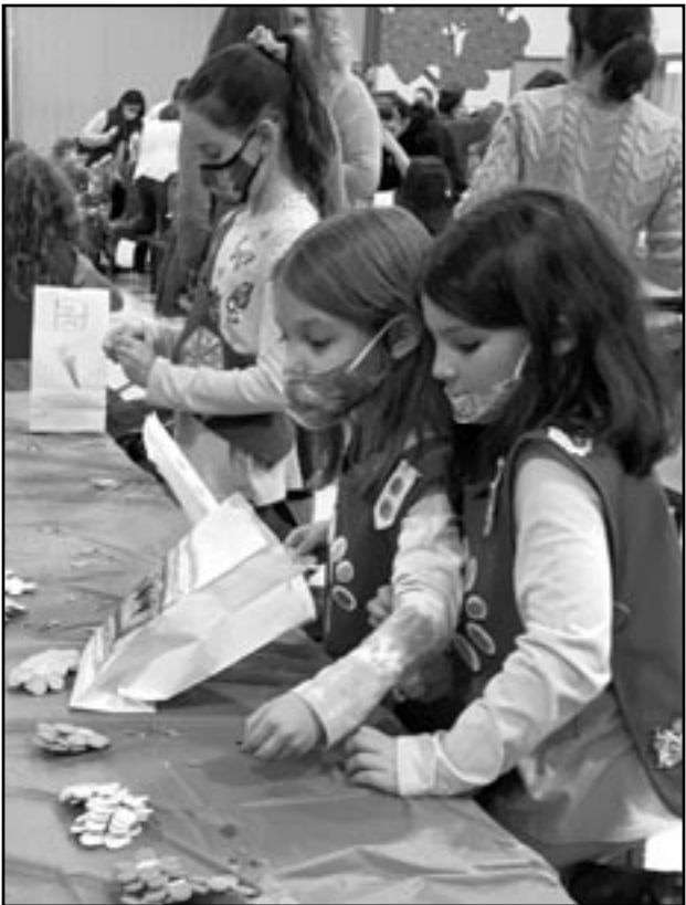
(above) Brownies concentrate on making the best “whatchamacallits” at the recent Long Hill Girl Scouts SWAPfest.