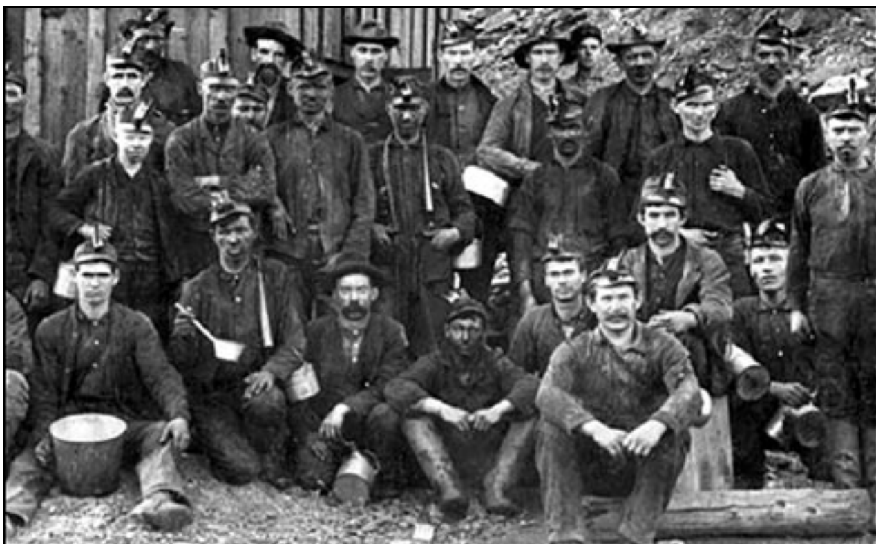
(above) Miners at the Teabo Mine in Rockaway Township, c. 1880. The public is invited to contribute vintage photos and other information to the "Morris County's Miners" collection.

What will you be doing this summer? Consider joining the team at Long Hill Parks & Recreation. Needed: Summer Camp staff, Counselors, Supervisors, EMTs, Lifeguards and Swim Instructors. Apply by Monday, April, 4, 2022. For more information and to apply please visit longhillnj.gov/recreation/index.html .