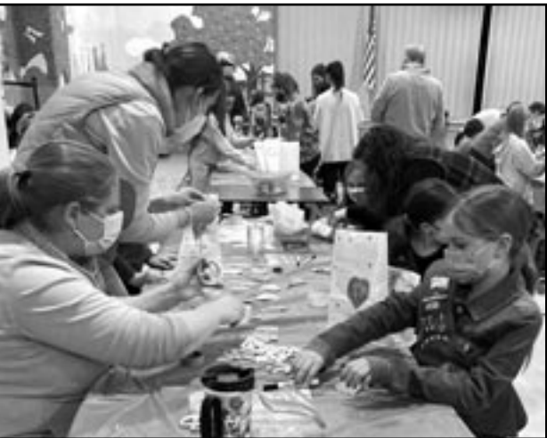
(above) Creativity, fun, and friendship are the hallmarks of the annual Long Hill Girl Scouts SWAPfest, held recently at Millington School.