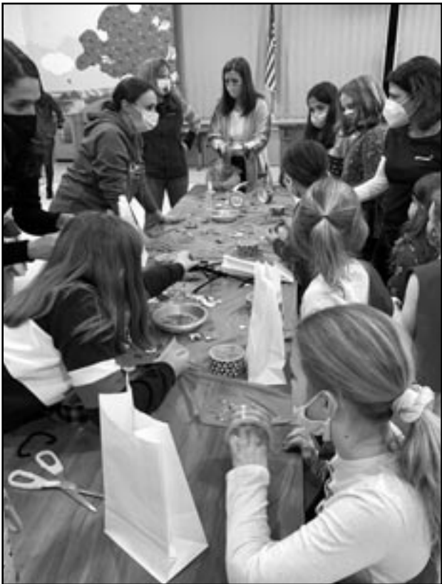
(above) Daisies enjoy getting crafty at the recent SWAPfest, a popular annual Girl Scout event.