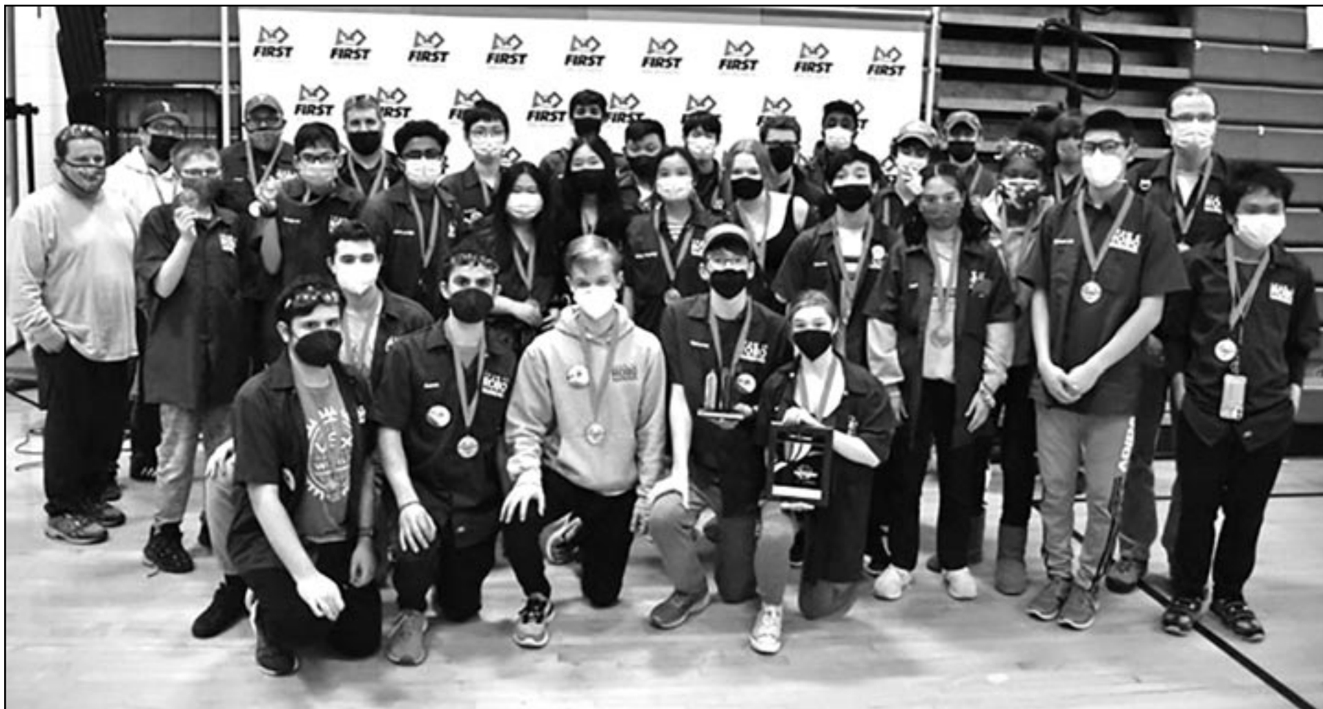
(above) Watchung Hills Regional High School Team 41 RoboWarriors

Team sponsors include: Picatinny Arsenal/The Knotts Company/Nokia Bell Labs/Picut Manufacturing/Warren Lions Club/Intuitive Surgical/Thor Labs/P&R Fasteners Inc./Advent Industrial/Offaly Associates LLC/Advanced Circuits/Watchung Hills Education and Technology Foundation & Watchung Hills Regional High School.