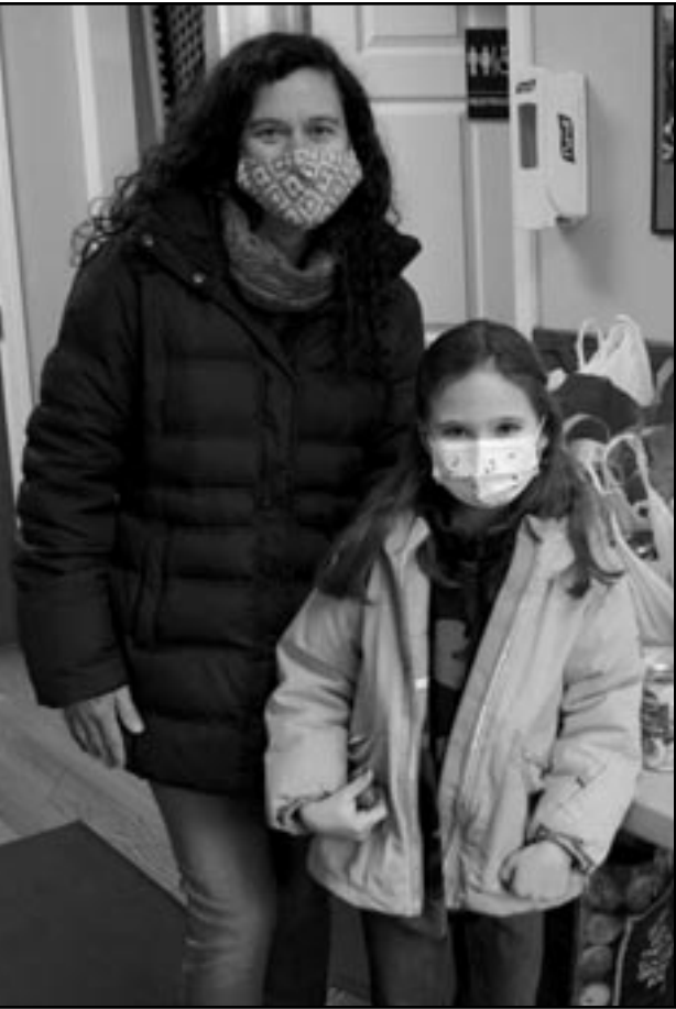
(above) In keeping with the Girl Scout spirit of giving back, participants at the Long Hill Girl Scouts SWAPfest brought non-perishable food items for the Twelve Baskets Food Pantry.