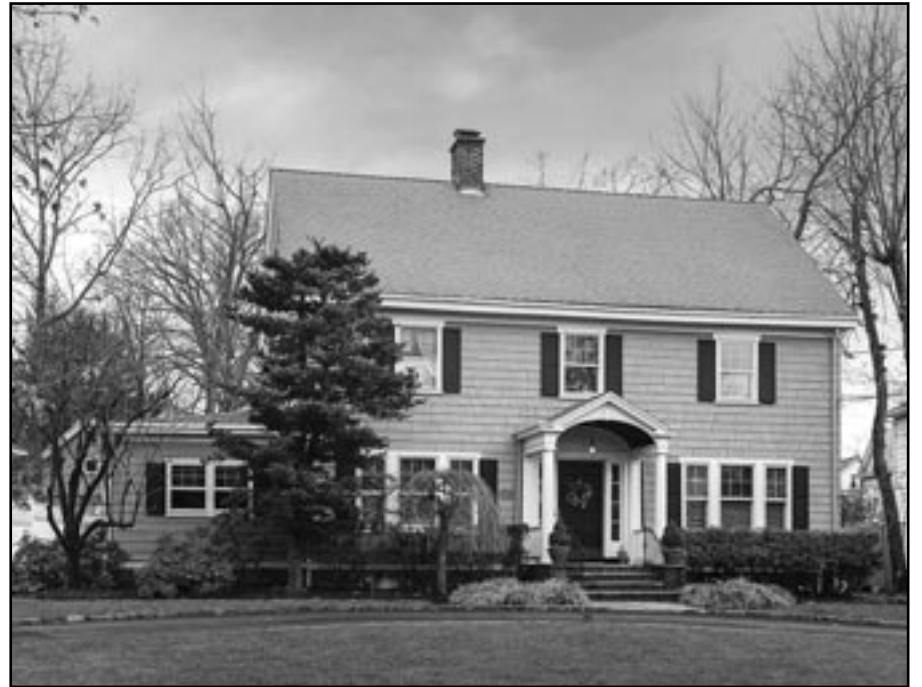
214 Park Street, Westfield 5 Bedrooms | 3.1 Baths | $1,100,000