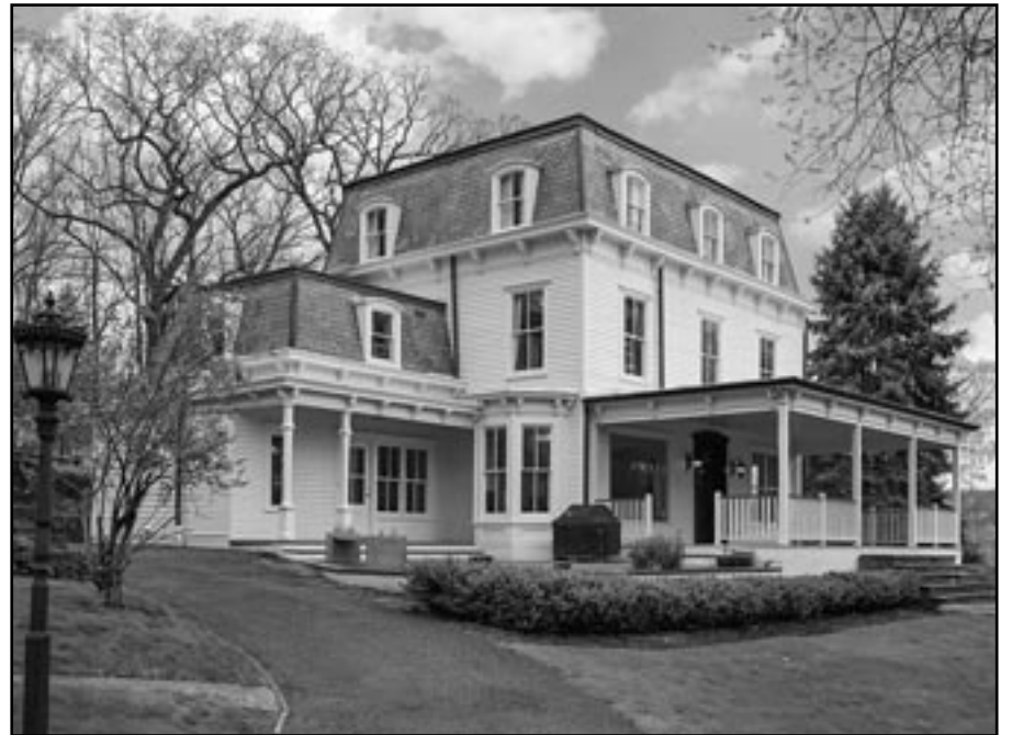
1370 Johnston Drive, Watchung 8 Bedrooms | 5.1 Baths | $900,000