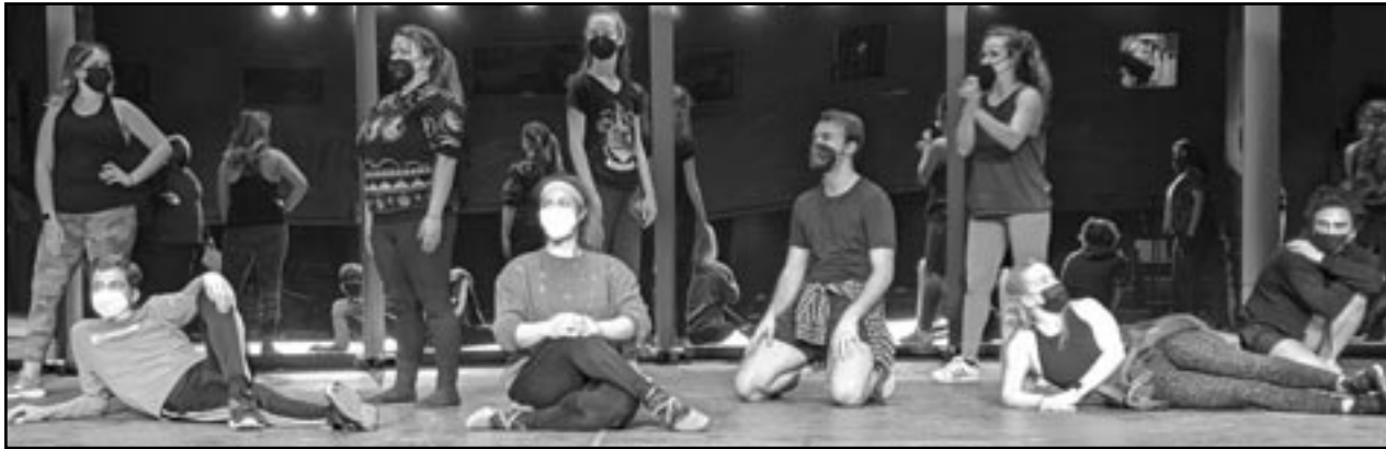
(above) Cast of A Chorus Line. Visit cdctheatre.org for ticketing information.