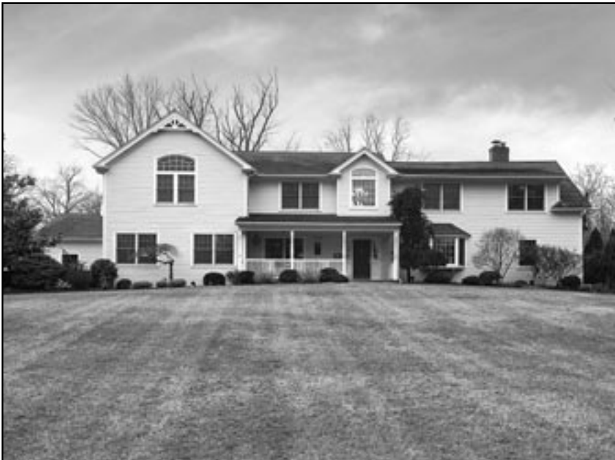
295 New Providence Road, Mountainside 5 Bedrooms | 4.2 Baths | $1,575,000