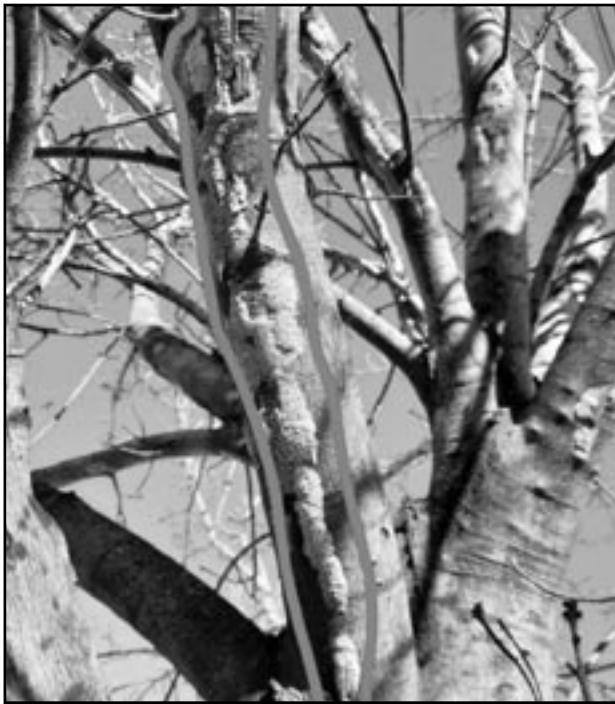
(above) The weather is warming up, check your trees for Spotted Lanternfly egg masses. When you find them crush them. Use an old bank card, small rolling pin or putty knife.

As SLF feeds, the insect excretes honeydew (a sugary substance) which can attract bees, wasps, and other insects. The honeydew also builds up and promotes the growth for sooty mold (fungi), which can cover the plant, forest understories, patio furniture, cars, and anything else found below SLF feeding.