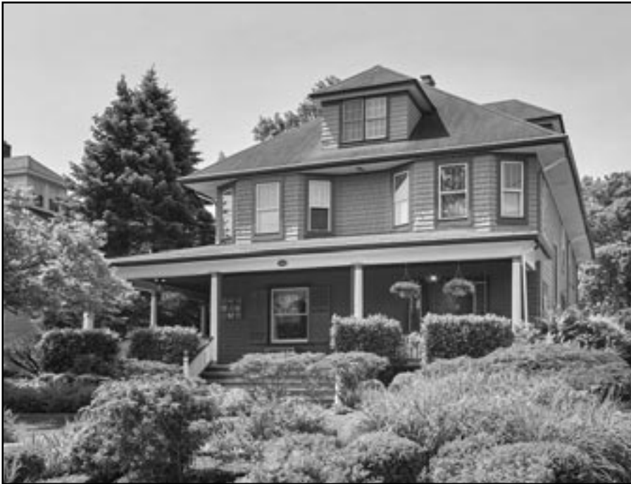
155 N. Euclid Avenue, Westfield 5 Bedrooms | 4.2 Baths | $1,795,000