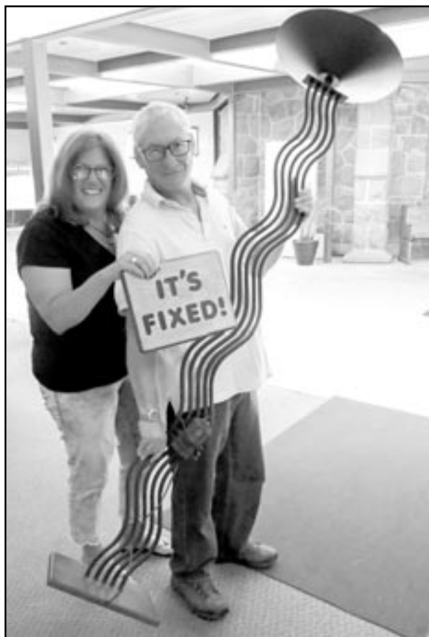
(left) Bring your beloved but broken items to Summit's Repair Café on Saturday, March 26 from 11 a.m. - 3 p.m. at Christ Church, located at 561 Springfield Ave., Summit, NJ, at the corner of Springfield and New England Avenues.