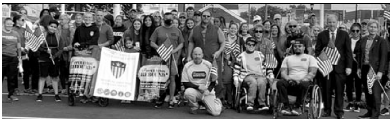
(above) Memorial Day Murph Event