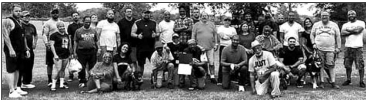
(above) Disabled Veteran BBQ Picnic