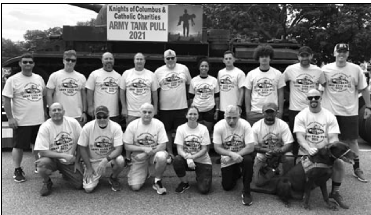
(above) Knights of Columbus Tank Pull

If you are interested in joining the team, please send us an email at NJVN1775@gmail.com and provide your name, email, and phone number. Also, if you have any questions, and concerns please feel free to contact us at 973-332-1556.