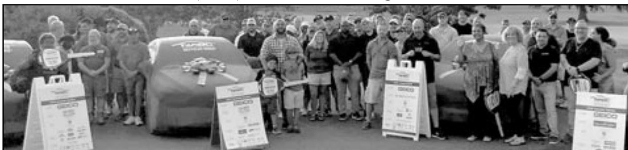
(above) Recycled Rides, Veteran Car Give Away Event