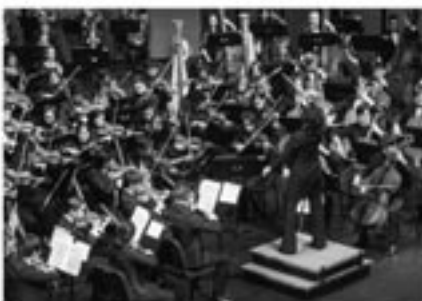
NJYS Youth Symphony