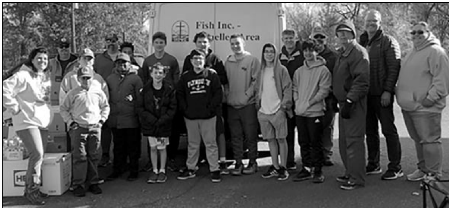
(above) Green Brook's Scouting For Food Drive, which benefits the Fish, Inc. Dunellen Area's food pantry