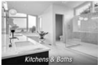
Kitchens & Baths