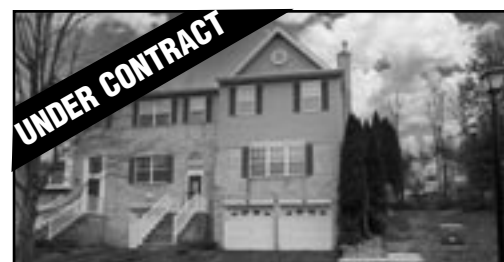
207 Tallwood Lane, Green Brook 2 Bed / 2.2 Bath / 2 Car Garage End-unit townhouse w/finished basement