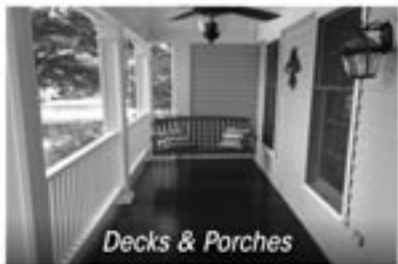
Decks & Porches