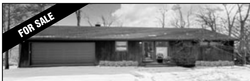
34 Rock Rd West, Green Brook 4 Bed / 2 Bath / 2 Car Garage Open floorplan w/spectacular view