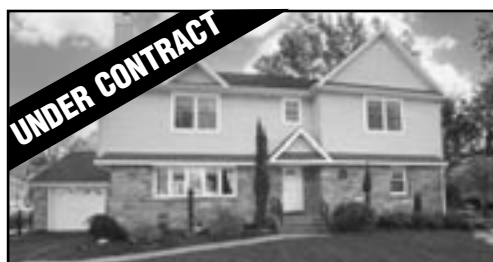
3 Renda Place, Green Brook 5 Bed / 3.1 Bath / 1 Car Garage Over 3,200 square feet of living space