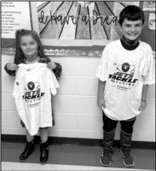
(above) November 2021 Jet Upstanders of the Month