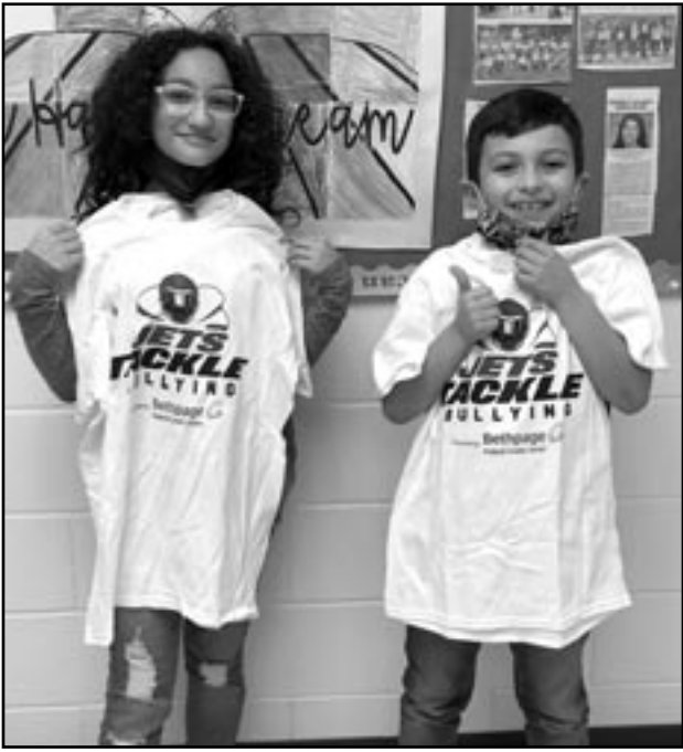
(above) December 2021 Jet Upstanders of the Month