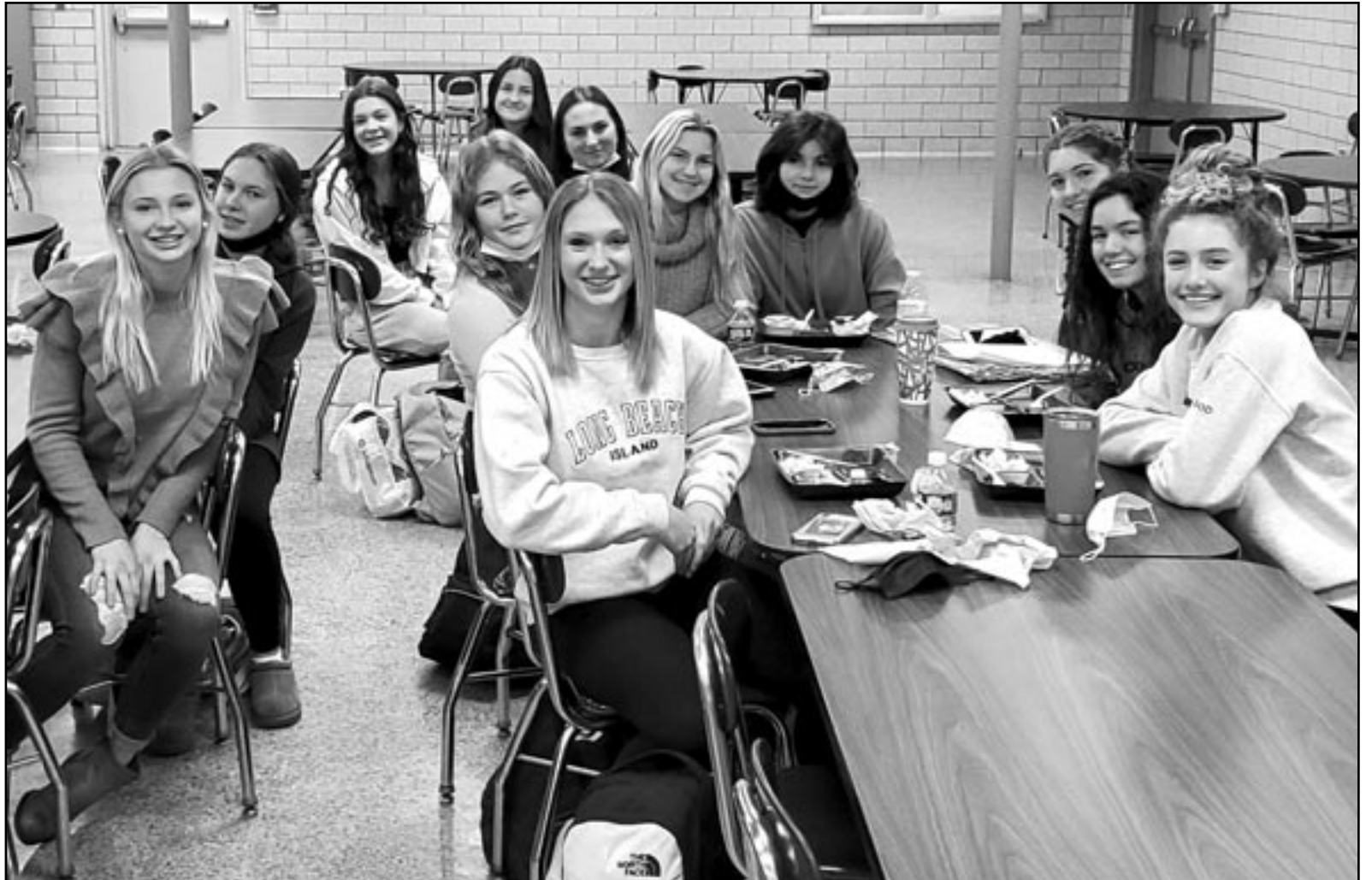
(above) The Field Hockey Team enjoys breakfast as a reward for winning the 2021 Fall G.P.A. Challenge.