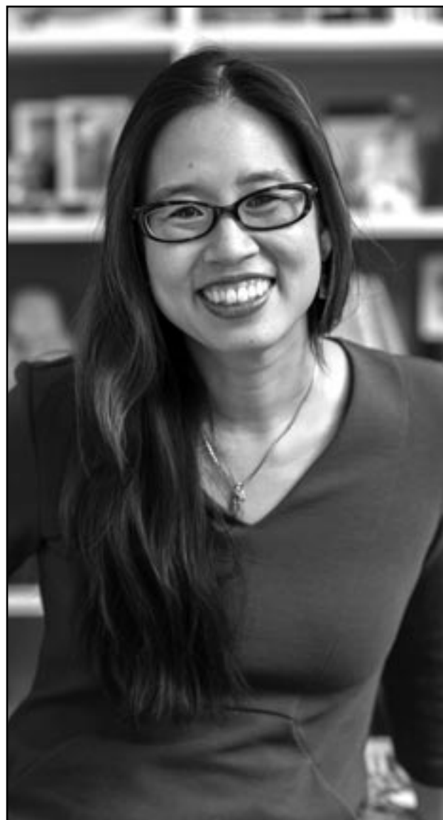
(above) Grace Lin, Author of Bringing In the New Year , will speak about the Lunar New Year during a virtual program on January 25th from 4:30 p.m. to 5:20 p.m.