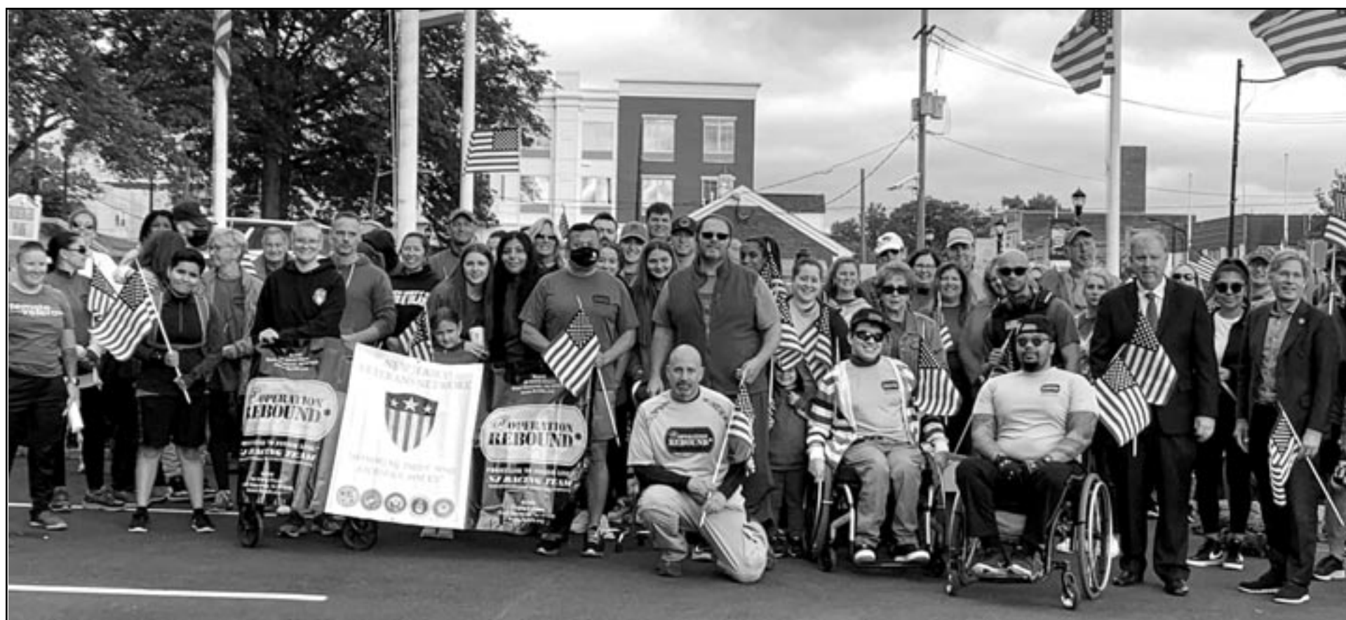
(above) Memorial Day Murph Event