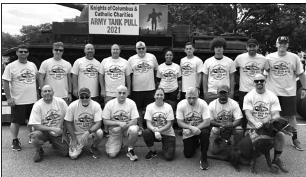
(above) Knights of Columbus Tank Pull

If you are interested in joining the team, please send us an email at NJVN1775@gmail.com and provide your name, email, and phone number. Also, if you have any questions, and concerns please feel free to contact us at 973-332-1556.