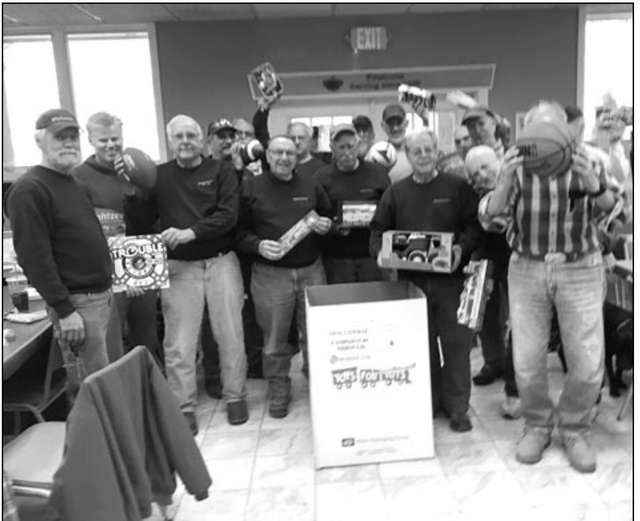
(above) The happy group of Flintlock volunteers donating toys to the Toys for Tots program.

The Flintlock volunteers who donated toys to the program are former scouts who also donate approximately 5,000 volunteer hours per year to the Boy Scout Council, which includes helping to do maintenance and build new structures throughout all of the scout camps. They meet at the Flintlocks building at Camp Winnebago, located at 102 Timberbrook Road, Rockaway, NJ, the first building on the right, every Thursday from 8 a.m. to 2 p.m. Guests are always welcome.