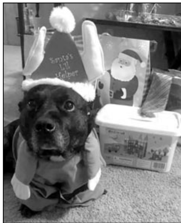
(above) Shadow suites up at Christmastime as "Shadow the Reindeer" and assists NJVN volunteers in delivering .

We are a group of veterans and volunteers dedicated to helping our veterans and their families live better lives. Our entire team is truly committed and dedicated with helping veterans and their families live a better way of life. If any veteran or their family members needs any assistance, or if you'd like to contribute or join our team of volunteers, please contact us at via email NJVN1775@gmail.com or call 973-332-1556.