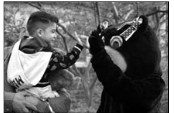
(above) Captain America and Mr. Incredible, and Kenilworth's School bear mascot visited homes of each adoption.

hand selected by the Phi Eta Omega Chapter of Alpha Kappa Alpha. Each family received a WalMart gift card funded by the Union County Bar Association. Costumes for CASA's interns were loaned by generous members of the Facebook Buy Nothing Group in Cranford and Garwood.