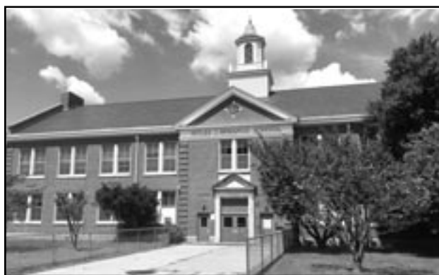
(above) McManus School was selected to participate in the United We Create Project.

"We promote a sense of belonging by developing an inclusive environment built around diversity, self-awareness, and personalized learning experiences," the application read. "Our goal is to inspire lifelong global learners who are committed to creating meaningful contributions beyond the walls of our school."