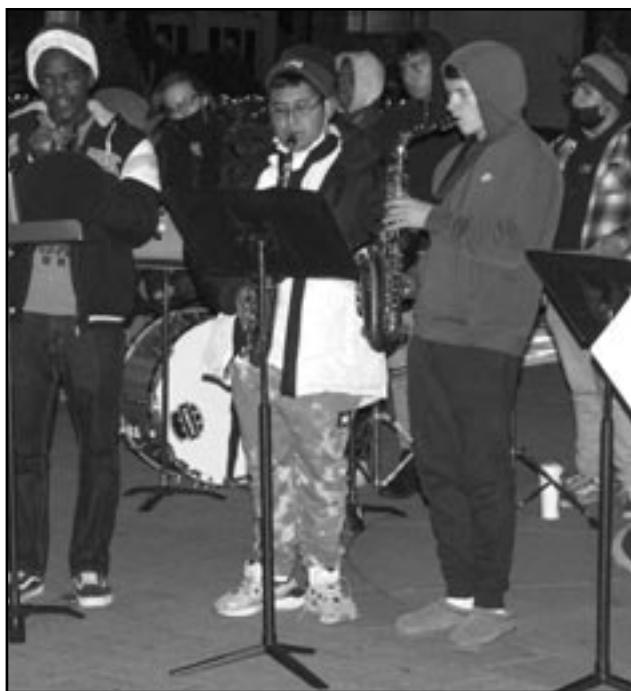
(above) Members of the Linden High School Marching Band.