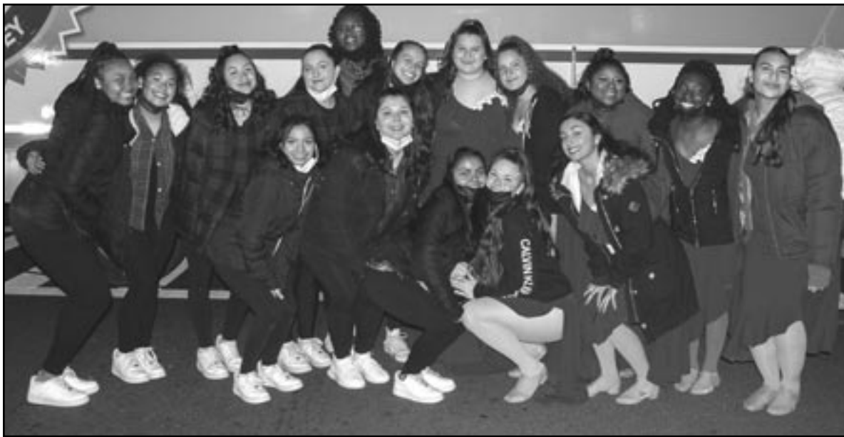
(above) Linden High School Dance Company

The City of Linden welcomed in the holiday season with a tree lighting event on Friday, Dec. 3rd in front of City Hall. Some of the festivities included were entertainment, make your own smores at a fire pit, and photos with Santa at the Promenade after he lit the Christmas tree.