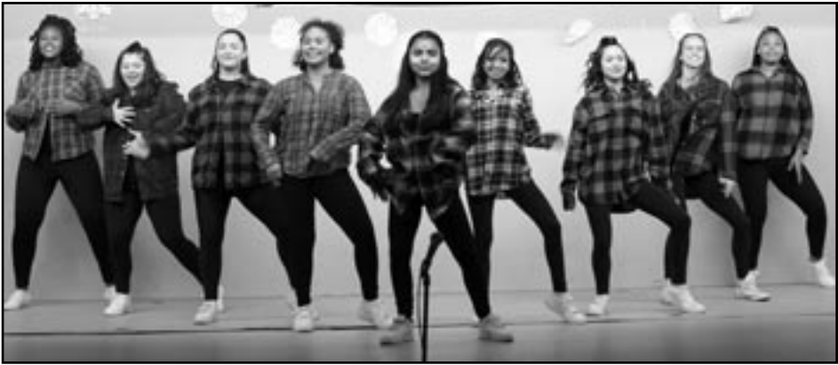
(above) Linden High School Madrigals