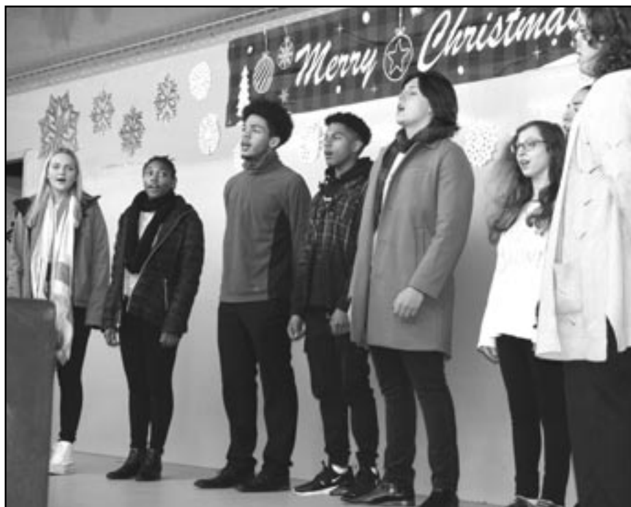
(above) Madrigal Singers featuring students from Linden High School.

Photos from this and other events can be found online at rennamedia.com and on the Life in Linden page on facebook.com . Feel free to “Like”, “Tag” and “Share”.