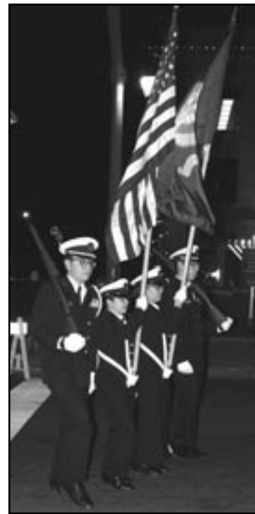
(above) Presentation of Colors by Linden High School NJROTC.

PRSR STD U.S. POSTAGE PAID BRIDGEPORT CT PERMIT NO. 390