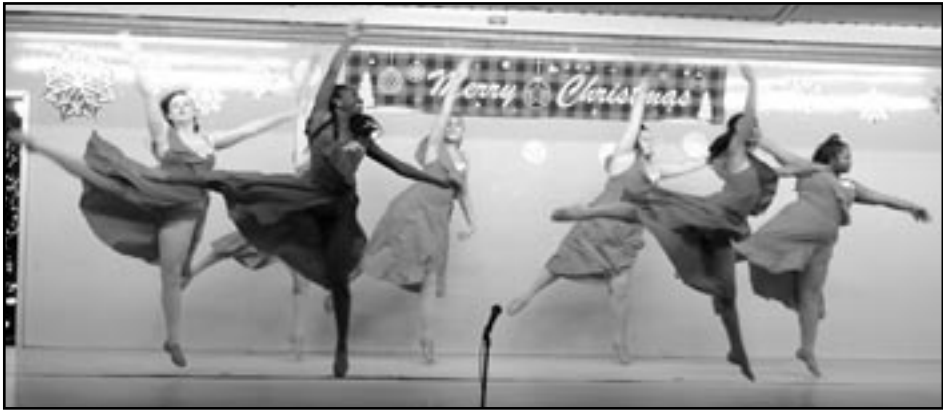
(above) Linden High Scholl Dance Team