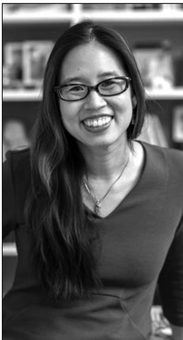
(above) Grace Lin, Author of Bringing In the New Year , will speak about the Lunar New Year during a virtual program on January 25th from 4:30 p.m. to 5:20 p.m.