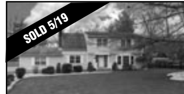
6 Remrose Ledge, Green Brook Listed by Roseann