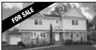
3 Renda Place, Green Brook 5 Bed / 3.1 Bath / 1 Car Garage Over 3,200 square feet of living space