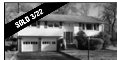
15 Blue Hill Terrace, Green Brook Listed by Roseann