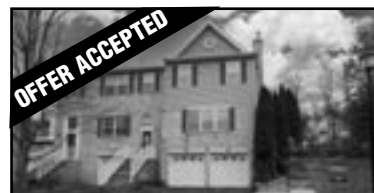
207 Tallwood Lane, Green Brook 2 Bed / 2.2 Bath / 2 Car Garage End-unit townhouse w/finished basement