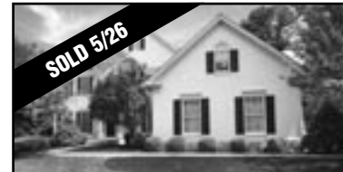
60 Ridge Rd, Green Brook Listed by Roseann