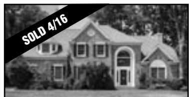
1 Bayview Terrace, Green Brook Listed by Roseann