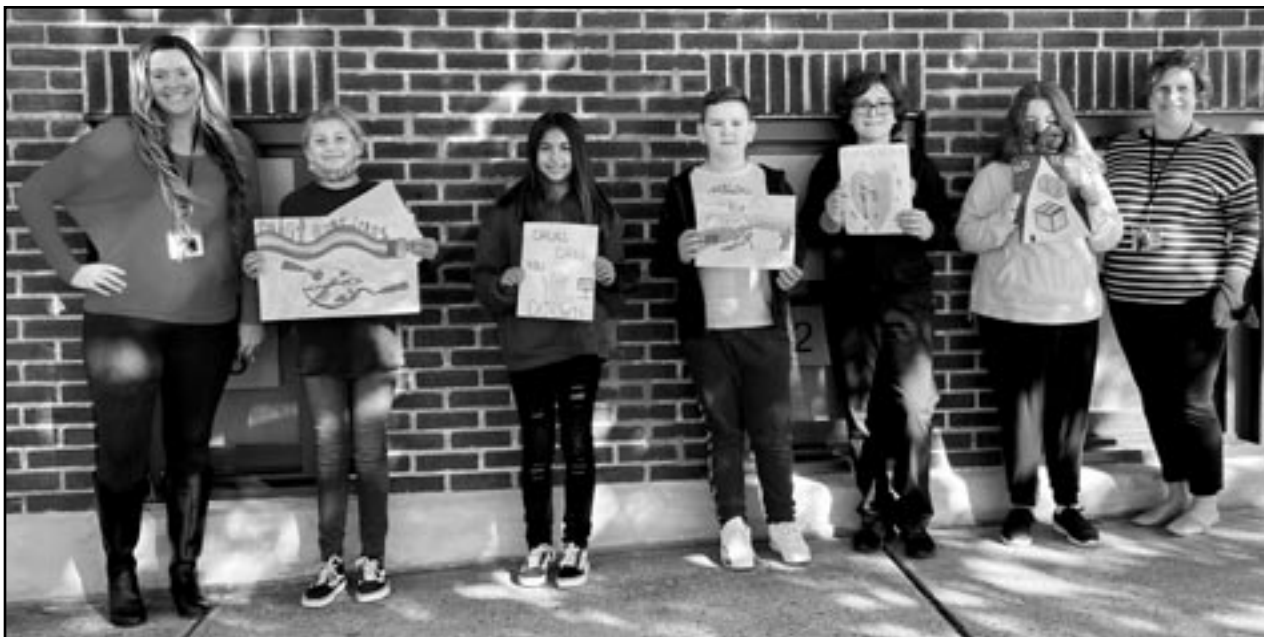
(above) Five Winners of Anti-Drug Poster Contest