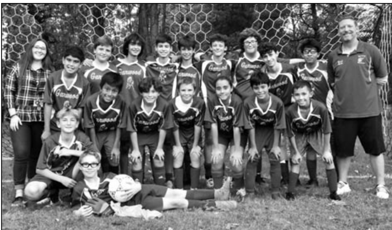
(above) The Garwood Middle School Co-ed Soccer Team