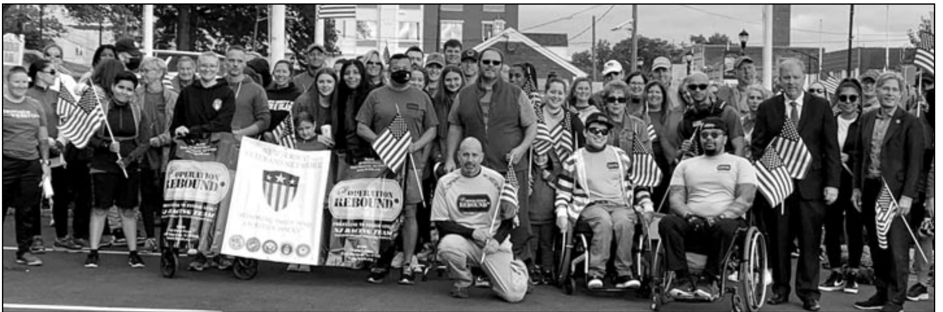
(above) Memorial Day Murph Event

If you are interested in joining the team, please send us an email at NJVN1775@gmail.com and provide your name, email, and phone number. Also, if you have any questions, and concerns please feel free to contact us at 973-332-1556.