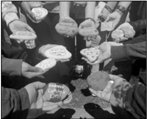
(above) Members of the Lincoln School Student Council show the rocks they painted during their Kindness Rocks community project.