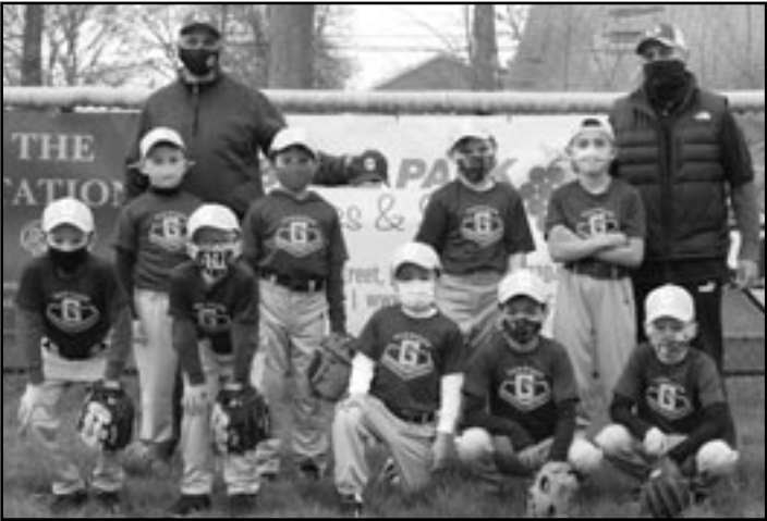
(above) Roselle Park Wine & Spirits