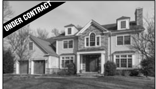
306 Massachusetts Street, Westfield 5 Bedrooms | 4.1 Baths | $1,599,900