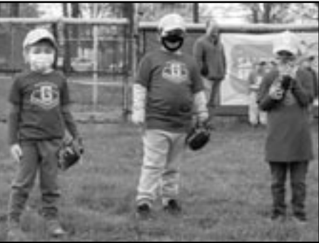
(above) Garwood Auto