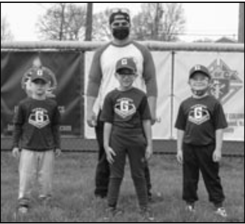
(above) Garwood PBA