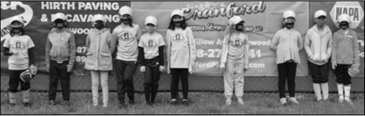
(above) Hirth Paving