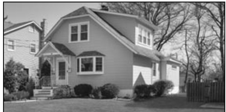
230 Virginia Street, Westfield 4 Bedrooms | 2 Baths | $550,000