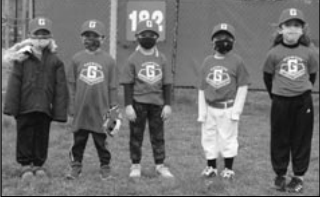
(above) Garwood Fire Department