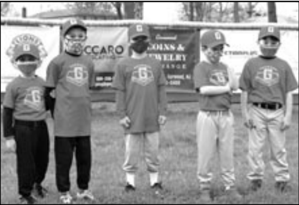
(above) Target Transportation