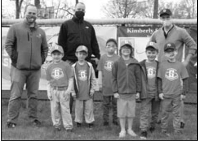
(above) Sunny Side Digital