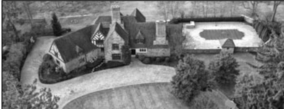
14 Kimball Circle, Westfield 5 Bedrooms | 5.1 Baths | $3,850,000