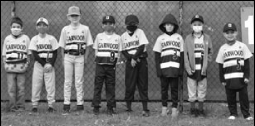
(above) Galluzzo Brothers Gunners