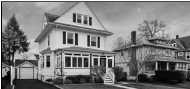
553 First Street, Westfield 4 Bedrooms | 3 Baths | $649,000