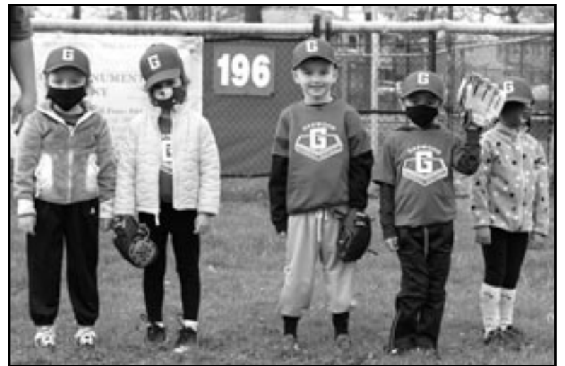
(above) Garwood Lanes

PRSRT STD U.S. POSTAGE PAID BRIDGEPORT CT PERMIT NO. 390