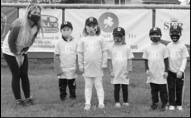
(above) RC Kids Academy