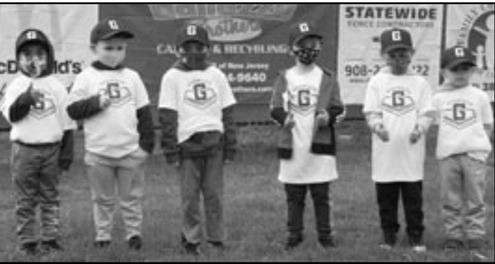
(above) Garwood Lions