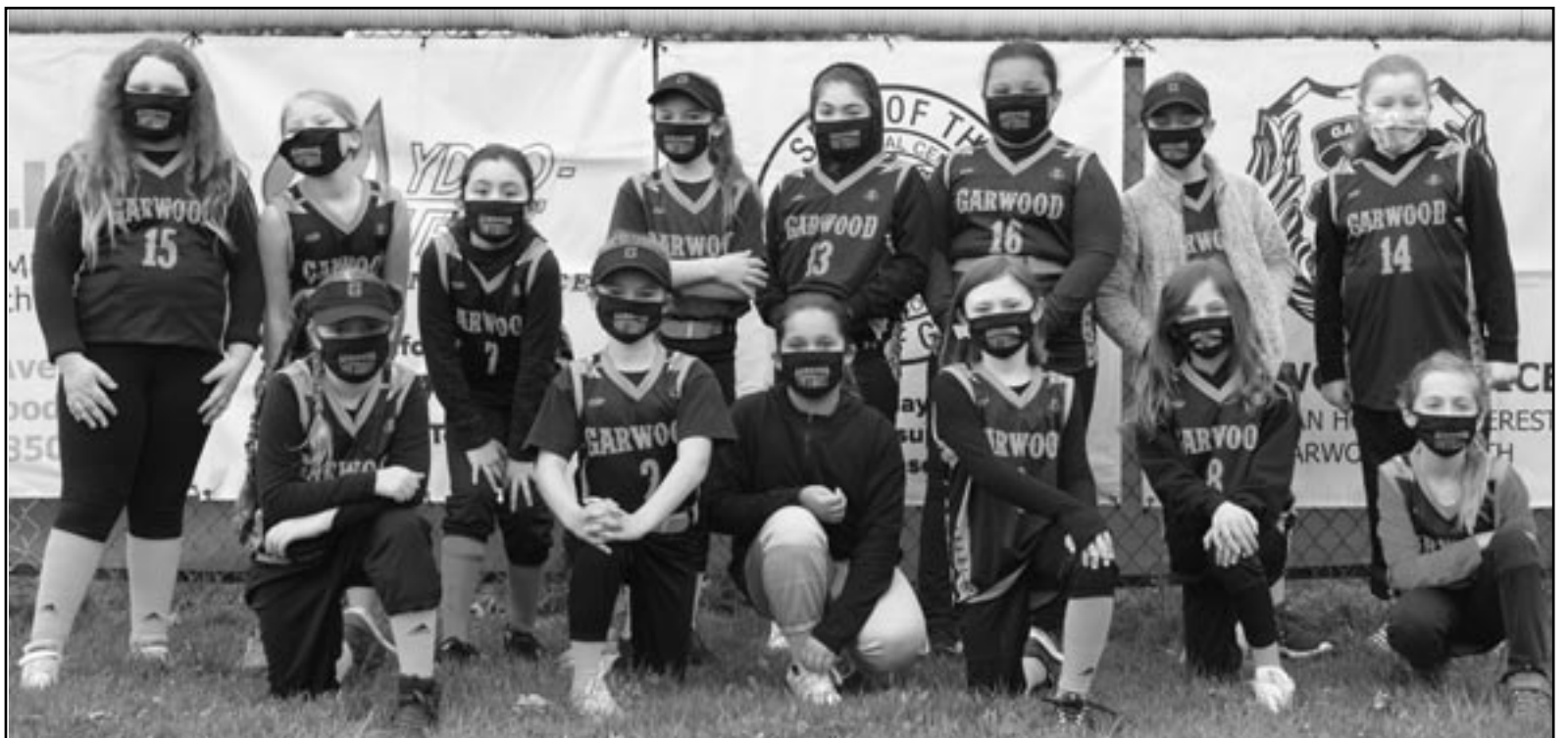
(above) Marano & Sons

Photos from this and other events can be found online at rennamedia.com and on the Garwood Times page on facebook.com . Feel free to "Like," "Tag," and "Share."