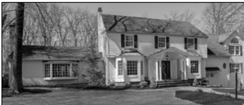
941 Fox Hill Lane, Scotch Plains 5 Bedrooms | 4.3 Baths | $1,399,900