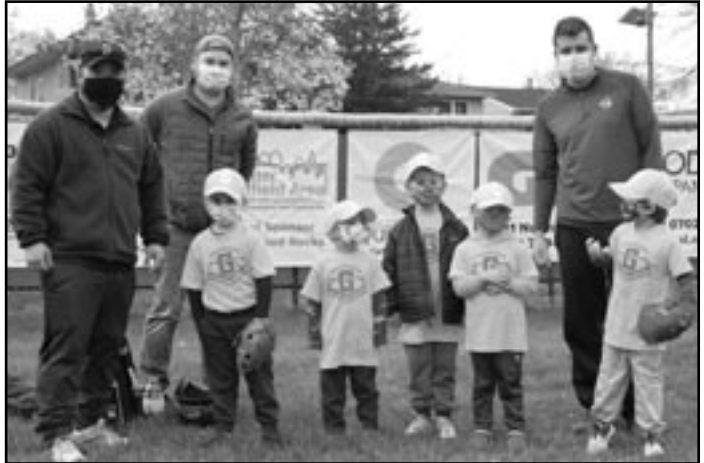
(above) The Station