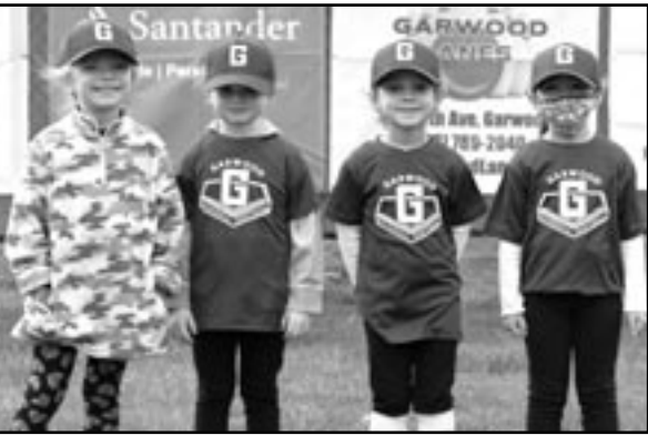
(above) Perfection Plus