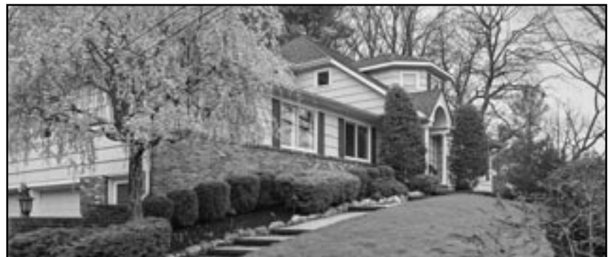
37 Barchester Way, Westfield 5 Bedrooms | 3.1 Baths | $1,150,000