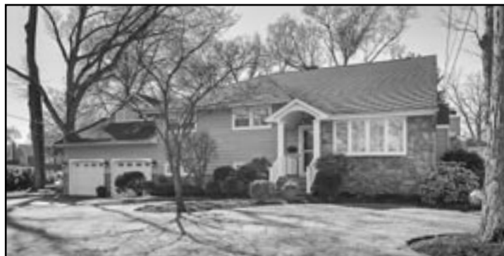
225 Eton Place, Westfield 4 Bedrooms | 2.1 Baths | $899,900