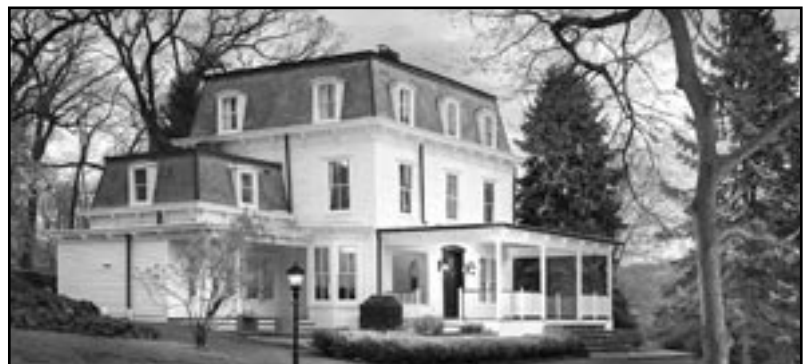
1370 Johnston Drive, Watchung 8 Bedrooms | 5.1 Baths | $999,000