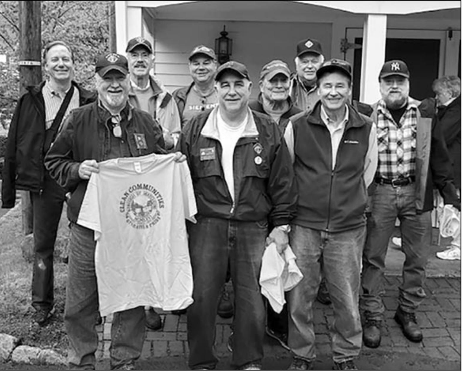
(above) Operation Pride in Watchung, NJ will be held at the Texier House on Saturday, May 1 from 10 a.m.-12 noon. (Rain Date May 2.)

The Recreation Commission will be providing fun activities for the children during the day. The Environmental Commission will distribute seedlings for people to plant with instructions on how to nurture the growth of new trees.