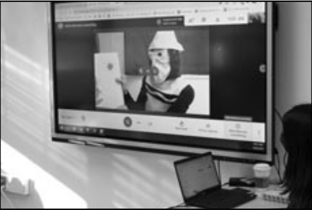
(above) The special guest reader in disguise!