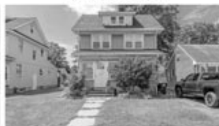
420 Stout Ave