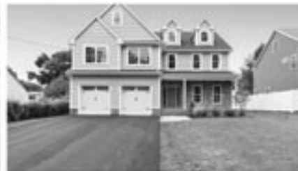
131 Russell Road