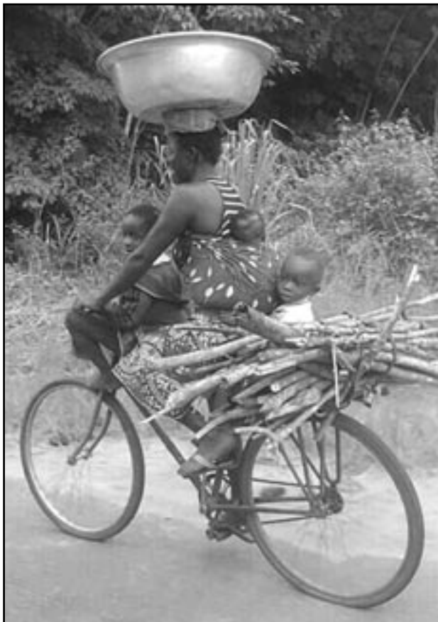
(above) This picture, sent to Faith by Pedals for Progress, demonstrates how completely and creatively the recipients use their bikes.