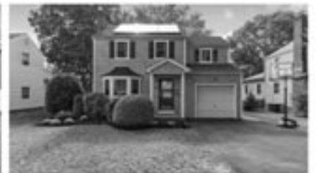
324 Montague Ave