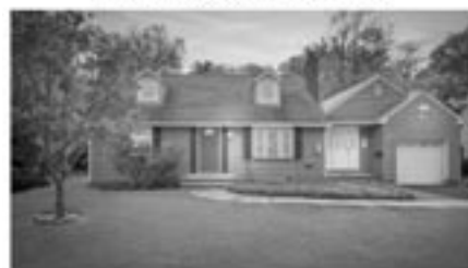
394 Acacia Rd