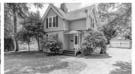
45 N Martine Ave