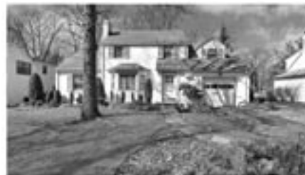
12 Homestead Terrace

I've recently had the pleasure of successfully marketing these area homes. If you are considering a move and would like to discuss my marketing plan, please give me a call!