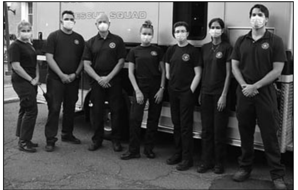
(above) Scotch Plains Rescue Squad welcomed new cadet members this past year.

When I became a member during the pandemic, I was very nervous at first. I was afraid of such a deadly outbreak that had cost so many people their lives. But as I started to get more patients, I realized how rewarding this job was. There needs to be people who help those who are in need and I like the fact that I can try and be one of those. Helping people makes me happy and after seeing many people in pain, I realized that I want to try and at least make them feel a little better no matter what the issue is. Becoming a member during the pandemic is probably one