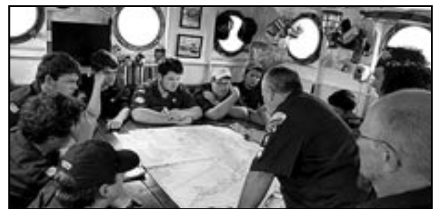
(above) Adult volunteers with maritime experience or captain's licenses are needed too. Visit our website for more information ship228.com , or email Ship228.SeaDart@gmail.com .