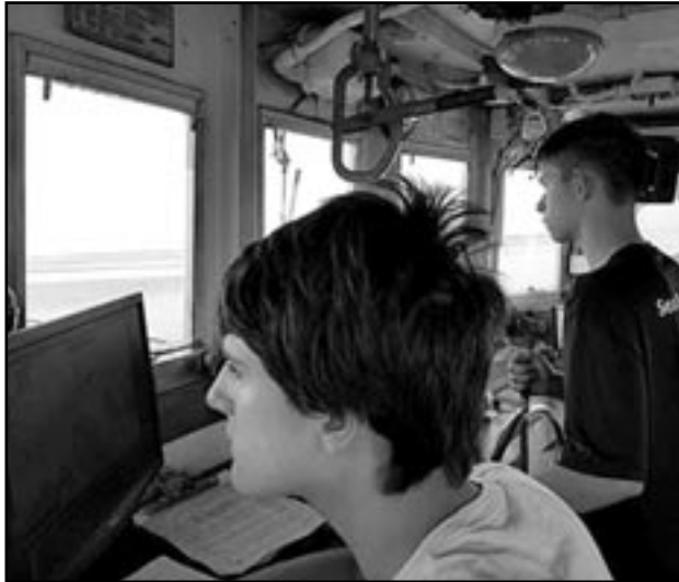
(above) Whether you're steering the vessel from the wheelhouse, learning engine room repair, or visiting a new location on one of the many trips, there's something you'll enjoy in Sea Scouting.

females ages 14-21 who have graduated the 8th grade; we also have a new Maritime Explorer Club for younger youth in 6th to 8th grade. Adult volunteers with maritime experience or captain's licenses are needed too. Join us for a day on the water and bring a friend! Visit our website for more information ship228.com .