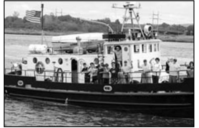
(above) Sea Scouts from Ship 228 operate the 65' vessel Sea Dart II, one of the largest Sea Scout vessels on the east coast, along with a fleet of smaller vessels (including sailboats) from their base located in Linden, NJ.

Sea Scouts from Ship 228 operate the 65' vessel Sea Dart II, along with a fleet of smaller vessels (including sailboats) from their picturesque base located in Linden, New Jersey. Sea Scouting (which is part of the Venturing Program of the Boy Scouts of America) offers young adults the opportunity to travel and learn skills that could be useful in future careers. Whether you're steering the vessel from the wheelhouse, learning engine room repair, or visiting a new location on one of the many trips, there's something you'll enjoy in Sea Scouting. So, try something different, check us out, and prepare yourself to set sail for a real adventure.