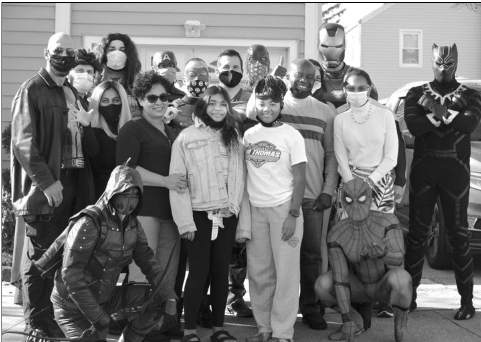
(above) The Pennicook Family of Union with Superheroes