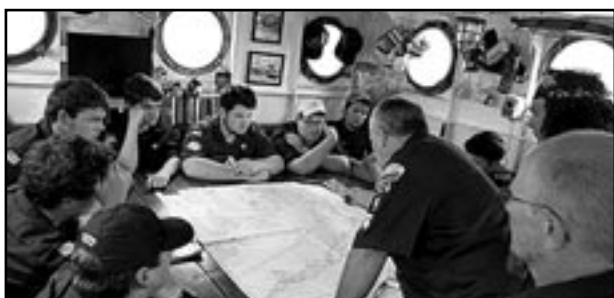
(above) Adult volunteers with maritime experience or captain's licenses are needed too. Visit our website for more information ship228.com , or email Ship228.SeaDart@gmail.com .

Are you interested in boating, sailing, or mechanics? Come check out Sea Scouting and let the adventure at sea begin! The crew of Ship 228 will be hosting a virtual open house, taking place over Zoom on Saturday, March 13 at 4:00 p.m. and featuring various activities that are bound to pique a young adult's interest in scouting.