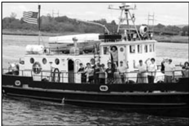
(above) Sea Scouts from Ship 228 operate the 65' vessel Sea Dart II, one of the largest Sea Scout vessels on the east coast, along with a fleet of smaller vessels (including sailboats) from their base located in Linden, NJ.