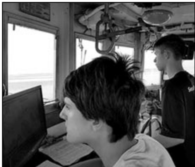
(above) Whether you're steering the vessel from the wheelhouse, learning engine room repair, or visiting a new location on one of the many trips, there's something you'll enjoy in Sea Scouting.

females ages 14-21 who have graduated the 8th grade; we also have a new Maritime Explorer Club for younger youth in 6th to 8th grade. Adult volunteers with maritime experience or captain's licenses are needed too. Join us for a day on the water and bring a friend! Visit our website for more information ship228.com .