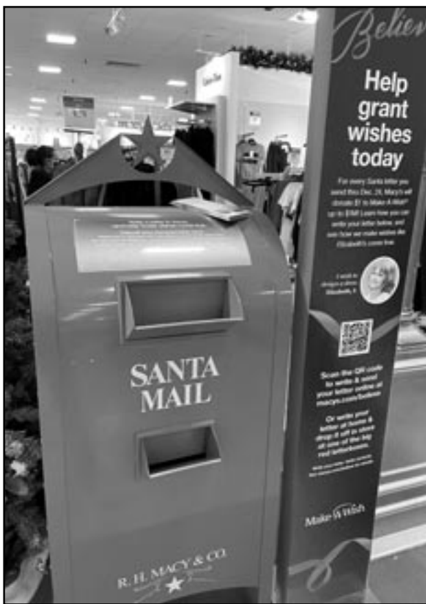
(above) Franklin Elementary School students helped support Make-A-Wish by writing 45 cards.

Now more than ever, as COVID-19 impacts our communities, hope is essential for waiting Wish kids who are isolated and vulnerable. For every letter Macy's receives, they will donate $1 to the Make-A-Wish®, up to $1 million! Students in the Blue and Gold Club wrote 45 cards and dropped them off at Macy's. The students were thrilled to be able to help make some kids' wishes come true.