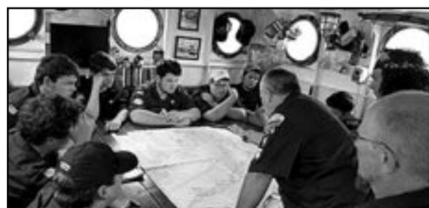
(above) Adult volunteers with maritime experience or captain's licenses are needed too. Visit our website for more information ship228.com , or email Ship228.SeaDart@gmail.com .