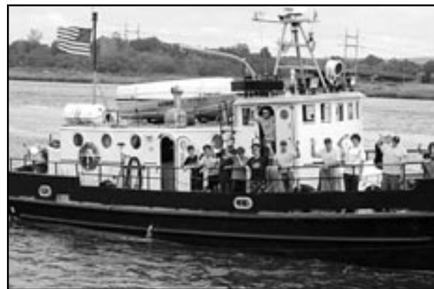
(above) Sea Scouts from Ship 228 operate the 65' vessel Sea Dart II, one of the largest Sea Scout vessels on the east coast, along with a fleet of smaller vessels (including sailboats) from their base located in Linden, NJ.

Sea Scouts from Ship 228 operate the 65' vessel Sea Dart II, along with a fleet of smaller vessels (including sailboats) from their picturesque base located in Linden, New Jersey. Sea Scouting (which is part of the Venturing Program of the Boy Scouts of America) offers young adults the opportunity to travel and learn skills that could be useful in future careers. Whether you're steering the vessel from the wheelhouse, learning engine room repair, or visiting a new location on one of the many trips, there's something you'll enjoy in Sea Scouting. So, try something different, check us out, and prepare yourself to set sail for a real adventure.