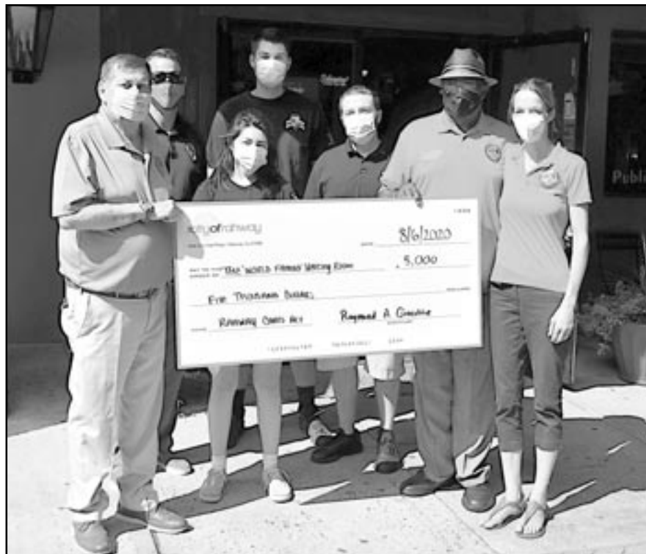
(above) The Waiting Room receives Rahway CARES check.

Eligible businesses must be a brick and mortar located in the City of Rahway, with 20 or fewer