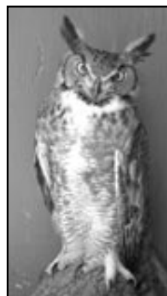
(above, l-r) Summer 1980: Baby Uggla and his tennis ball friend, Summer 1980 - As a fledgling in the Soucy family living room, Circa 1983: As a "young man", Circa 2018: Always ready to greet visitors.