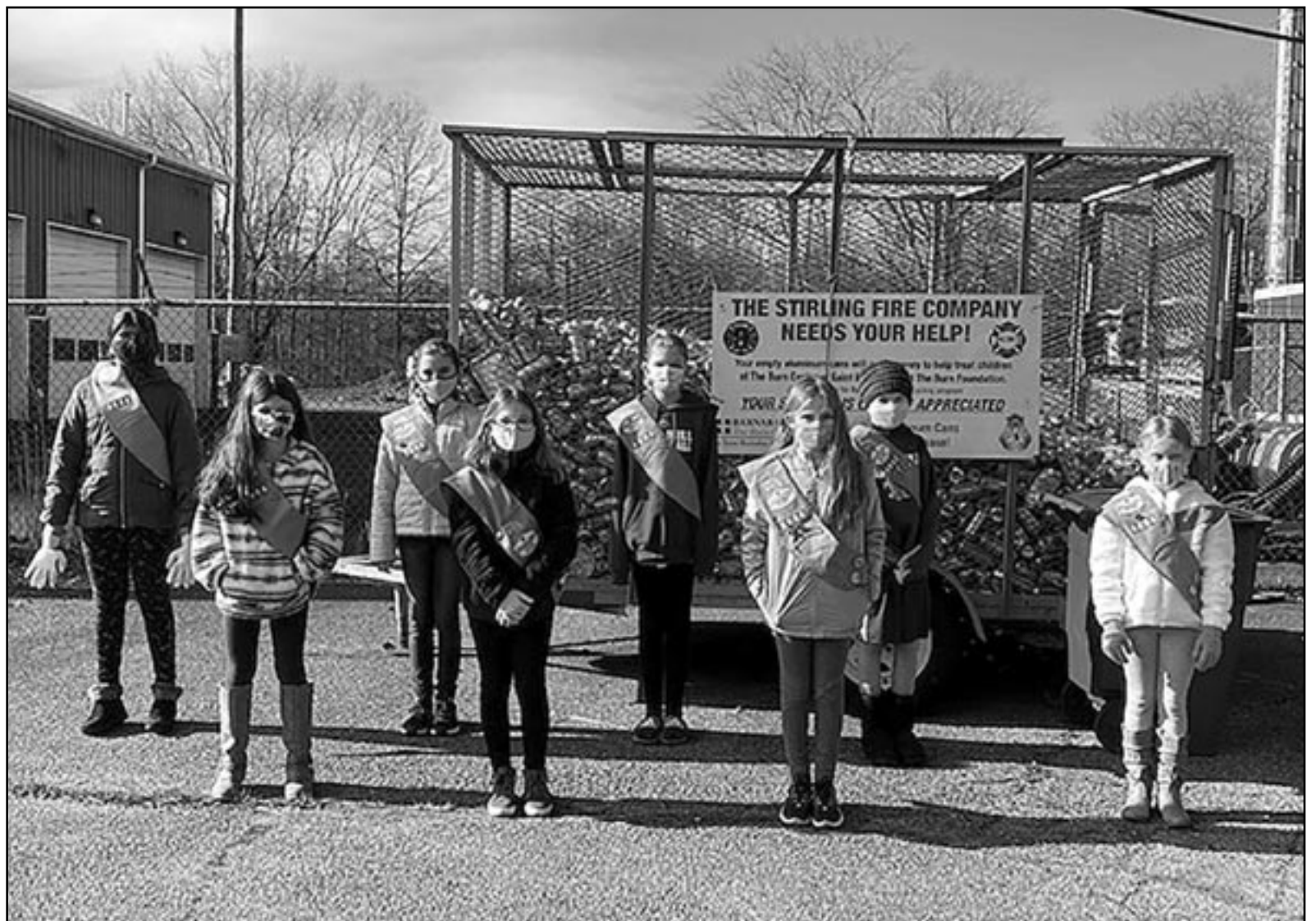
(above) Junior Troop 6604 completed a project to support Aluminum Cans For Burned Children, a program held at St. Barnabas Hospital to help treat pediatric burn patients and support their families.

On this journey, the girls teamed up to become agents of change and make the world a better place. The troop had multiple meetings where the girls discovered a problem, found a solution and implemented a plan. The objective of this journey was to bring awareness of this beneficial program. The troop encourages the community to continue bringing their aluminum cans to the ACBC trailer at the Long Hill Department of Public Works throughout the year.