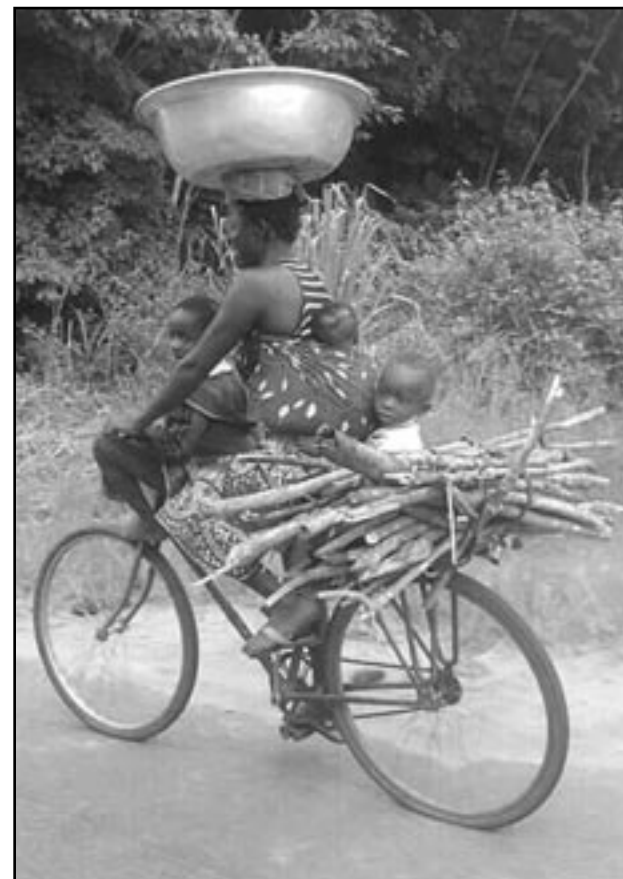
(above) This picture, sent to Faith by Pedals for Progress, demonstrates how completely and creatively the recipients use their bikes.