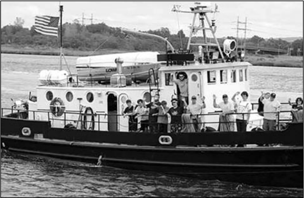
(above) Sea Scouts from Ship 228 operate the 65' vessel Sea Dart II, one of the largest Sea Scout vessels on the east coast, along with a fleet of smaller vessels (including sailboats) from their base located in Linden, NJ. Sea Scouting (Part of the Venturing Program of the BSA) offers young adults the opportunity to travel and learn skills that could be useful in future careers.