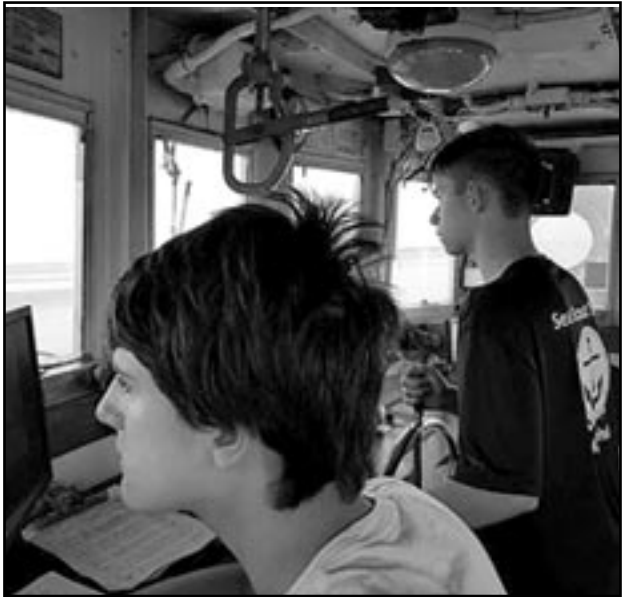
(above) Whether you're steering the vessel from the wheelhouse, learning engine room repair, or visiting a new location on one of the many trips, there's something you'll enjoy in