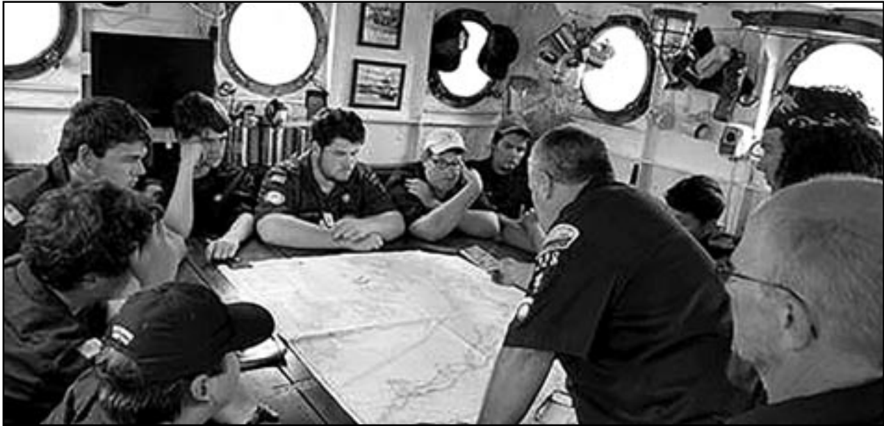
(above) Adult volunteers with maritime experience or captain's licenses are needed too. Visit our website for more information ship228.com , or email Ship228.SeaDart@gmail.com .