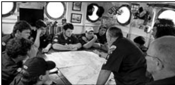
(above) Adult volunteers with maritime experience or captain's licenses are needed too. Visit our website for more information ship228.com , or email Ship228.SeaDart@gmail.com .

Sea Scouts from Ship 228 operate the 65' vessel Sea Dart II, along with a fleet of smaller vessels (including sailboats) from their picturesque base located in Linden, New Jersey. Sea Scouting (which is part of the Venturing Program of the Boy Scouts of America) offers young adults the opportunity to travel and learn skills that could be useful in future careers.