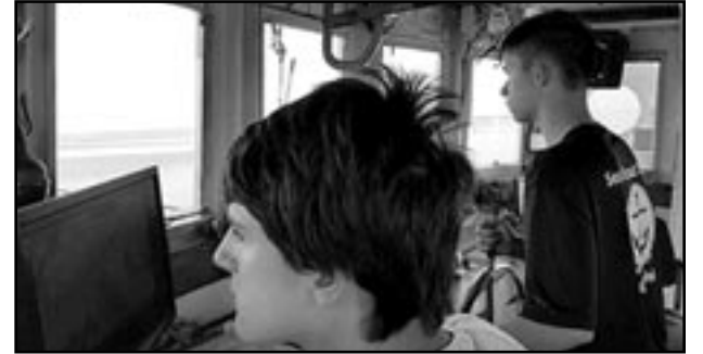
(above) Whether you're steering the vessel from the wheelhouse, learning engine room repair, or visiting a new location on one of the many trips, there's something you'll enjoy in Sea Scouting.

Whether you're steering the vessel from the wheelhouse, learning engine room repair, or visiting a new location on one of the many trips, there's something you'll enjoy in Sea Scouting. So, try something different, check us out, and prepare yourself to set sail for a real adventure.