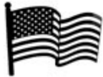
George Washington “Honesty” Abraham Lincoln “Equality” John F. Kennedy “Dedicated Service” Ronald Reagan “World Friend”