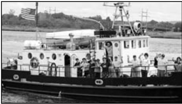
(above) Sea Scouts from Ship 228 operate the 65' vessel Sea Dart II, one of the largest Sea Scout vessels on the east coast, along with a fleet of smaller vessels (including sailboats) from their base located in Linden, NJ.

Sea Scouting is open to both male and females ages 14-21 who have graduated the 8th grade; we also have a new Maritime Explorer Club for younger youth in 6th to 8th grade. Adult volunteers with maritime experience or captain's licenses are needed too. Join us for a day on the water and bring a friend! Visit our website for more information ship228.com .