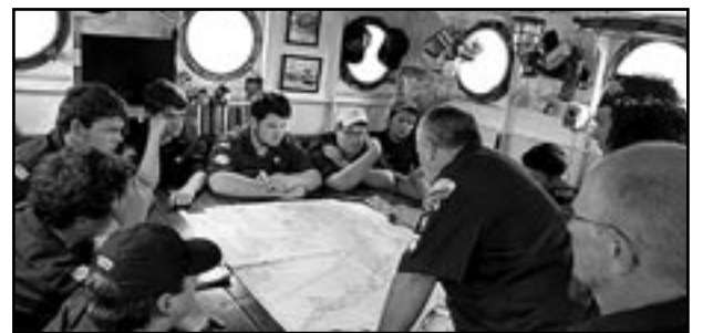
(above) Adult volunteers with maritime experience or captain's licenses are needed too. Visit our website for more information ship228.com , or email Ship228.SeaDart@gmail.com .