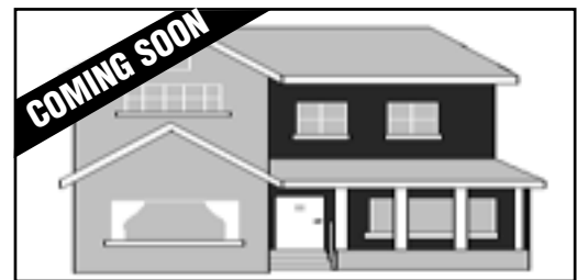
Mountainview Townhome 3 spacious levels of living space 2 Beds / 2.1 Baths / 1 Car Garage