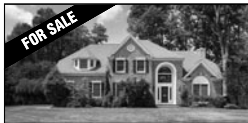
1 Bayview Terrace, Green Brook Updated kitchen & baths 4Beds / 3.1 Baths / 3 Car Garage / $795,000