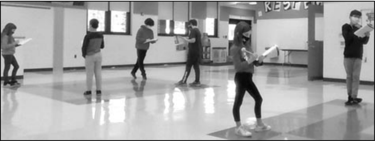
(above) Gifted and Talented students met in December to team build and plan future activities.