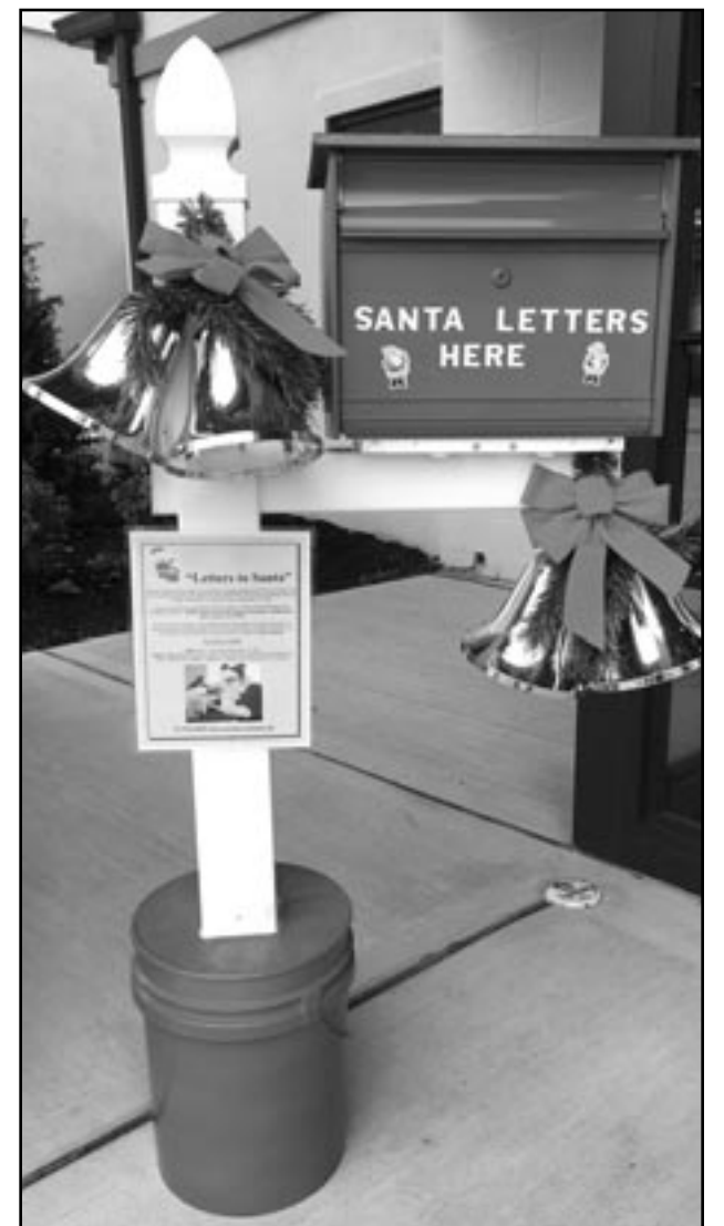
(above) Letters can be delivered to Santa by December 11 in front of Town Hall.

Every child will receive a personalized letter from Santa, but after December 11, Santa will be busy getting ready for the holiday and will not be able to answer any more letters. Mom and Dad, please be sure to include a return address.