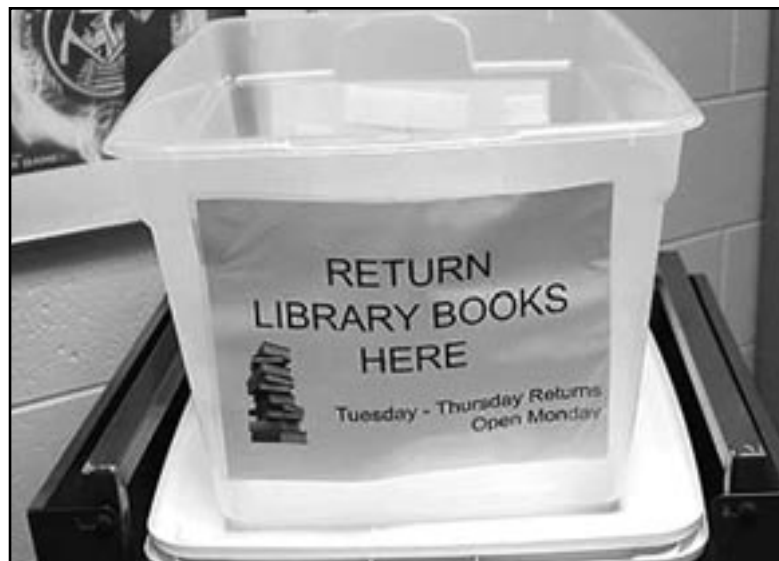
(above) When a book is returned to the library, it is placed in quarantine for a 3 day period. Only after the 3 day quarantine period is the book checked in and reshelfed.