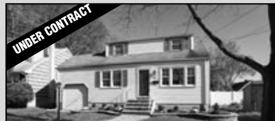
102 Gold St, Green Brook Freshly painted and beautiful curb appeal 4 Beds / 2 Baths / $359,000