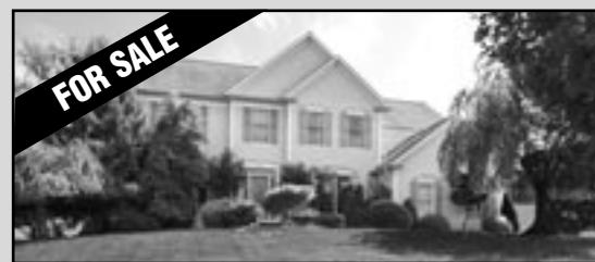
16 Warren Avenue, Green Brook Fabulous backyard oasis 4 Beds / 4.1 Baths / $819,000