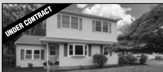
107 Mountain Pkwy, Green Brook Park-like and level backyard 4 Beds / 2 Baths / $439,000