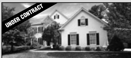
60 Ridge Road, Green Brook Meticulously updated colonial w/ in-law suite 6 Beds / 4.1 Baths / 3 Car Garage / $905,000