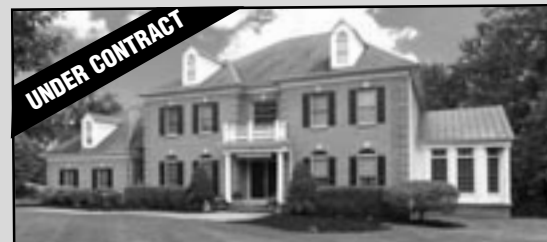
3 Oak Lane, Green Brook Resort-like w/spectacular view and Gunite pool 5 Beds / 5.2 Baths / $1,425,000