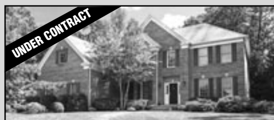
1 Bradley Ct, Green Brook Prime location w/sunset views 4 Beds / 4 Baths / $849,900