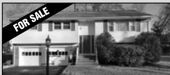
15 Blue Hill Terrace, Green Brook New kitchen and beautiful cul-de-sac location 4 Beds / 2 Baths / $489,000