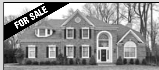
1 Bayview Terrace, Green Brook New kitchen, all hardwood, Tesla charging station 4 Beds / 3.1 Baths / $799,000