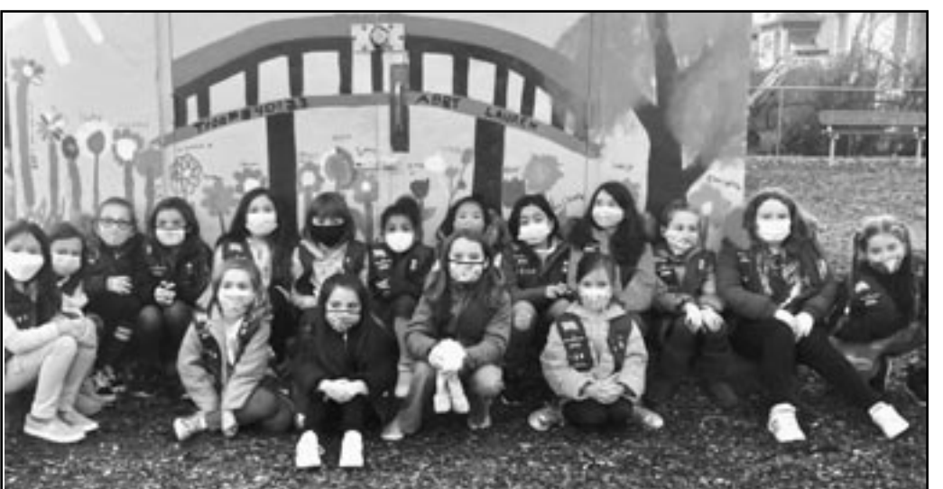
(above) Garwood Girls Scouts pose in front of the completed mural.