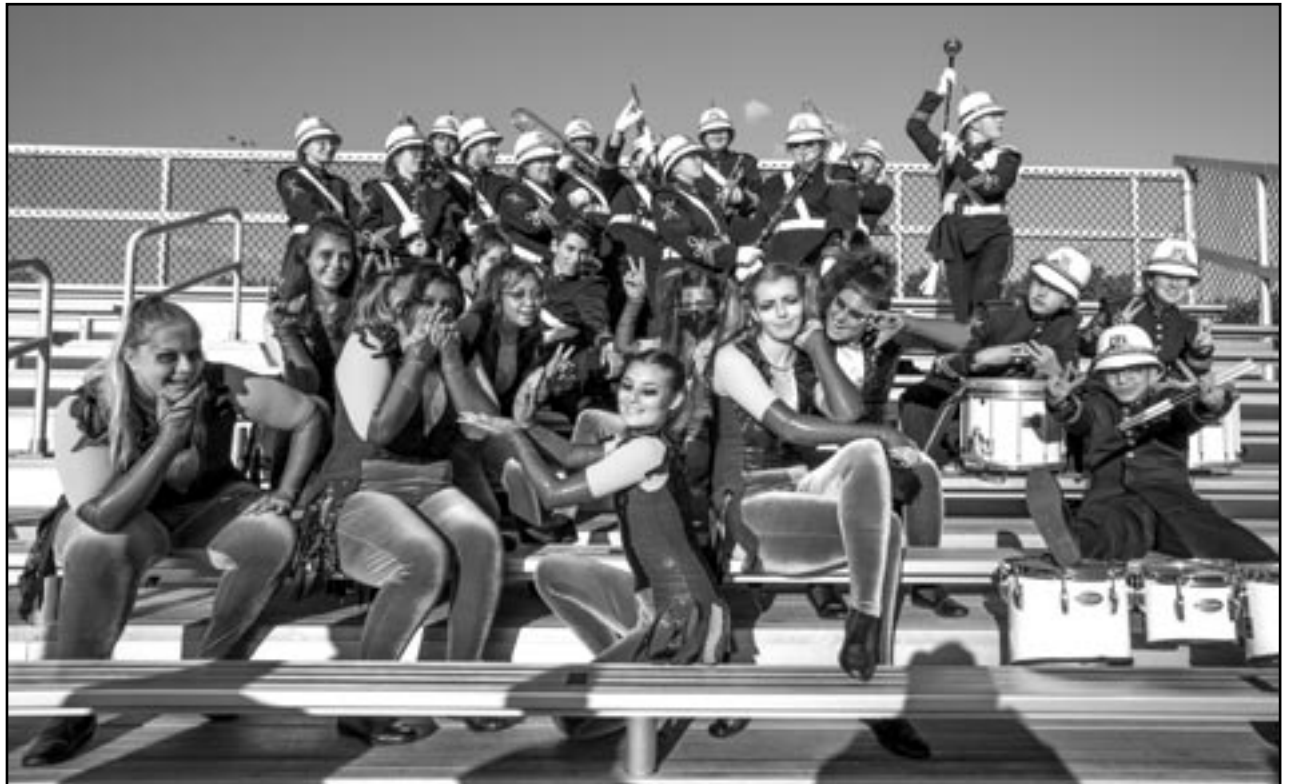
(above) The ALJ marching band had a spectacular season performing "Death On The Horizon."

attending 9th through 12th grade in High School are welcome to join the Crusaders Marching Band. If interested please contact a staff - band member for more information or email MPAClarkNJ@gmail.com