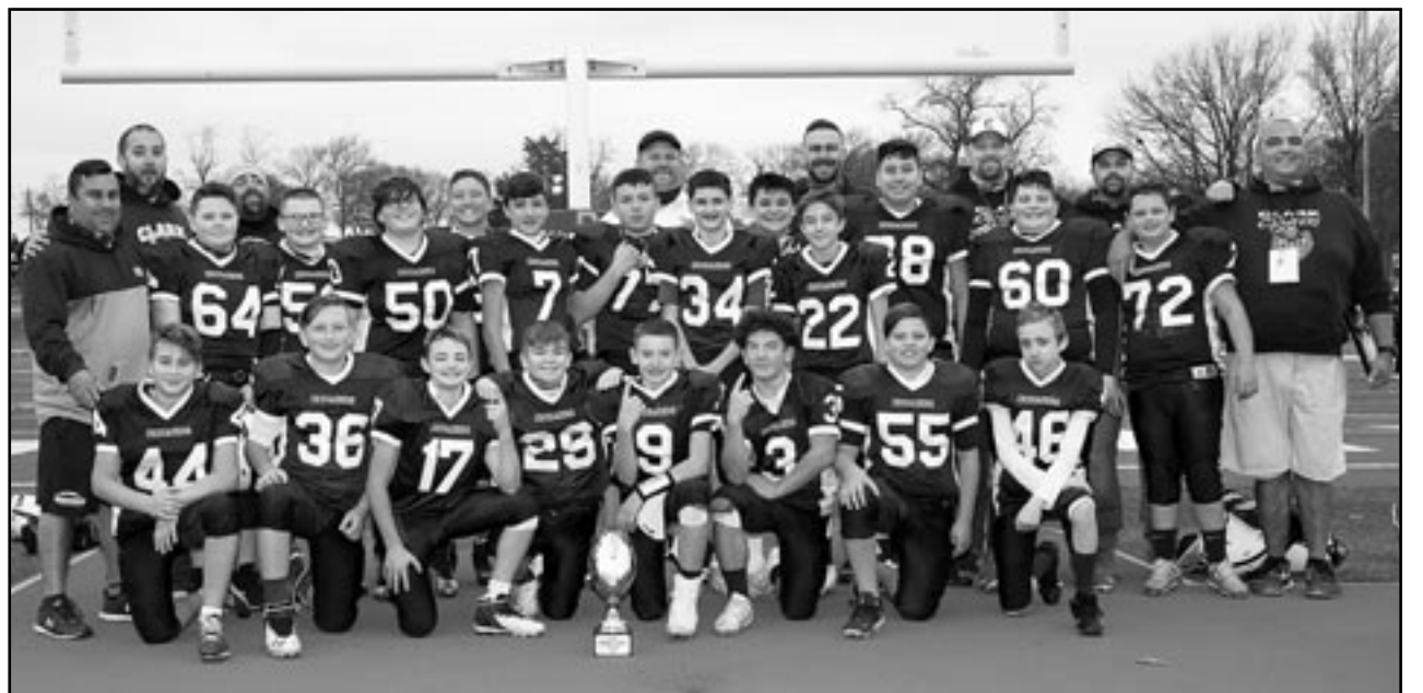
(above) B Level (7th Grade) after winning the Championship on Sunday, November 22, 2020.

Clark Youth Football is gearing up for an awesome third year in the Fall 2021. We will be opening up registration Super Bowl Sunday (February 07, 2021). Make sure to sign up and reserve your spot so you can be a part of our next CYF season!!!