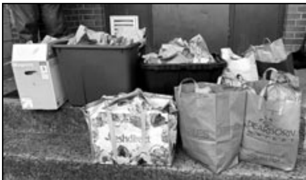
(left) The Coles Kids Care program, sponsored by the J.A. Coles PTA, continues to give back to those in need in our community throughout the school year.

The J.A. Coles PTA is a 501(c)(3) non-profit whose mission is to enhance the educational experience of our students and support the staff and parents at the J. A. Coles School in Scotch Plains, NJ.