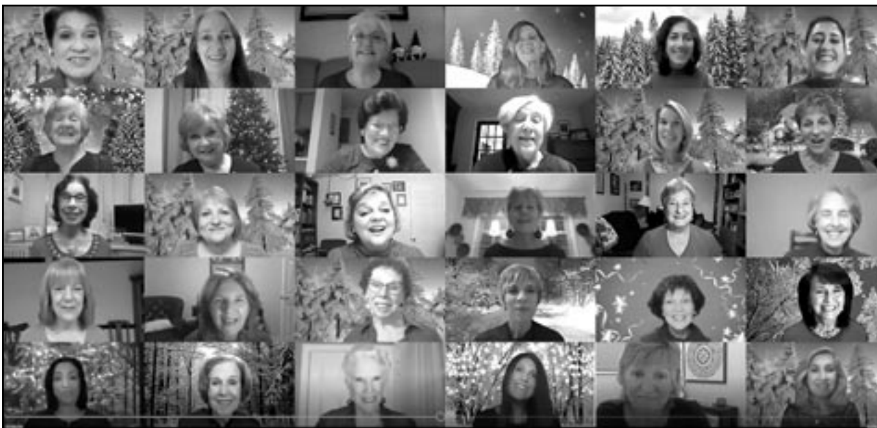
(above) The Hickory Tree Chorus chapter of Sweet Adelines International is offering a free Winter Sing series. Join the chorus via Zoom on Wednesdays in January, 7:15 to 9 p.m.

For more information visit hickorytreechorus.org .