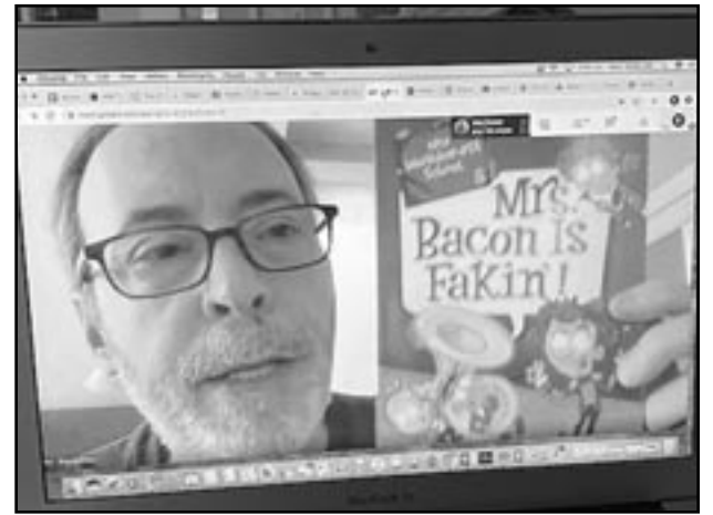
(above) Author Dan Gutman visited virtually with the students at J.A. Coles School.

The J.A. Coles PTA is a 501(c)(3) non-profit whose mission is to enhance the educational experience of our students and support the staff and parents at the J. A. Coles School in Scotch Plains, NJ.